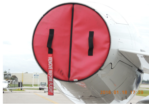
Embraer Legacy 500 Engine Exhaust Plug, folding type