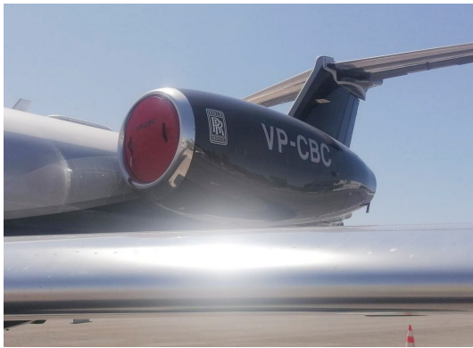
Embraer 135 Engine Inlet Plugs

The Engine Inlet Plugs are custom fit for your Embraer ERJ-135/140/145 Legacy 600, 650 intakes, made with heavy-duty vinyl material, and stuffed with a single block of sculpted urethane foam. Each plug has a zipper that allows the foam to be removed and dried if necessary. Engine plugs have 'remove before flight' streamers sewn onto the face of the plugs. Most plugs are imprinted with the aircraft registration number in black for an extra charge. Storage bag NOT included. Engine plugs may be inserted after flight when the engine is still warm. Engine Inlet Plugs are commonly referred to as Cowl Plugs, Intake Plugs, Cowl Blocks, Engine Blocks, and Engine Bungs.