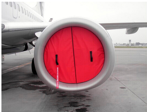
Boeing 737 Engine Intake Plug, Folding Type

The Engine Inlet Plugs are custom fit for your Embraer EMB-170/175 intakes, made with heavy-duty vinyl material, and stuffed with a single block of sculpted urethane foam. Each plug has a zipper that allows the foam to be removed and dried if necessary. Engine plugs have 'remove before flight' streamers sewn onto the face of the plugs. Most plugs are imprinted with the aircraft registration number in black for an extra charge. Storage bag NOT included. Engine plugs may be inserted after flight when the engine is still warm. Engine Inlet Plugs are commonly referred to as Cowl Plugs, Intake Plugs, Cowl Blocks, Engine Blocks, and Engine Bungs.