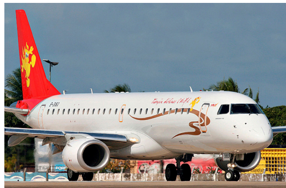
Covers, Plugs & HeatShields for Embraer 170/175/190/195