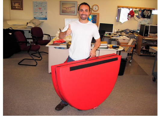
Boeing 737 FOD protection Intake Plug, folding type