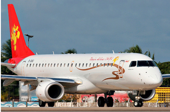
Covers, Plugs & HeatShields for Embraer 170/175/190/195

ALL-YEAR USE MATERIAL - Made with Silver Acrylic Sunbrella canvas, the all-year use material is the best option for sun protection and cover longevity. This heavier more durable material is intended for all weather conditions, such as rain and snow or lots of sun.