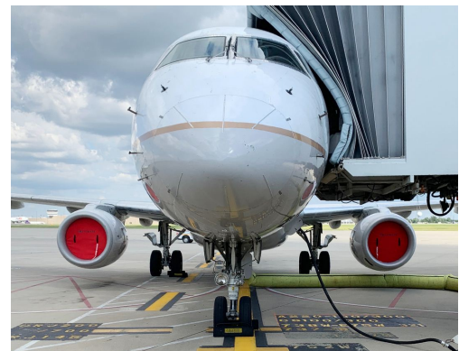
Embraer EMB-170/175 Engine Inlet Plugs