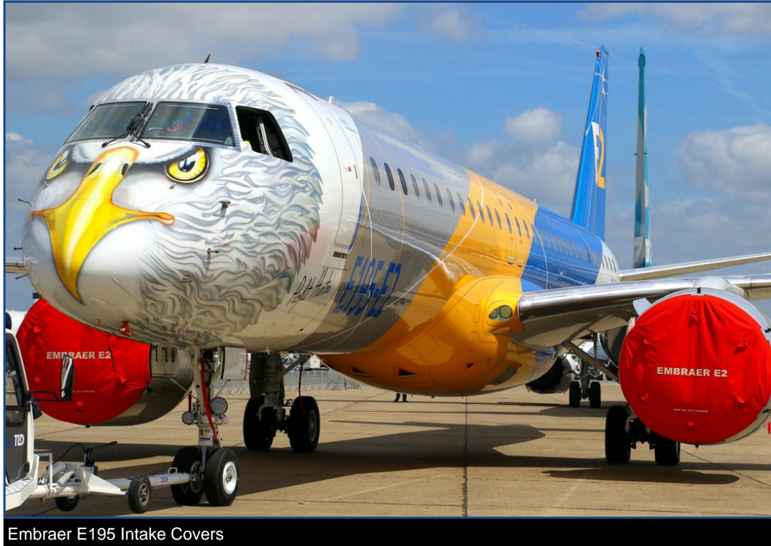
Embraer E195 Intake Covers