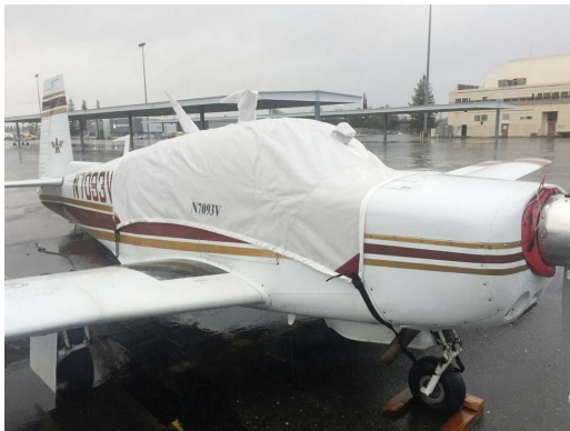
Mooney M20F Canopy Cover w/fwd extension, Engine Plugs

This cover type is made from Silver Acrylic Sunbrella canvas and is 100% lined with a soft and smooth microfiber. Bruce's Custom Covers developed this material combination especially for aircraft protection. The outer material is medium weight and treated for water resistance, UV resistance and anti-static buildup. The inner lining is a very soft and smooth microfiber to prevent scratching. The material is very reflective, and tests show that the cabin interior temperature can be reduced to near-ambient temperature on the hottest of days. It is water, ice and snow repellent, yet breathable to allow moisture to escape from between the cover and the aircraft surface.