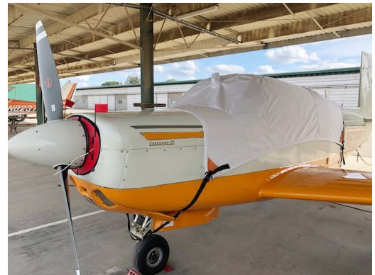
Mooney M20C Canopy Cover & Engine Plugs