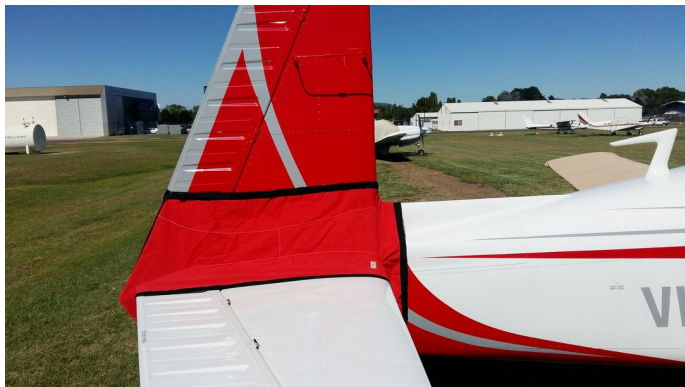
Mooney M20J Tailcone Cover

WINTER USE MATERIAL - Made with Solution-Dyed Polyester fabric, this option is intended for seasonal use to aid in deicing, rain mitigation, or for occasional travel. The material is lighter and more compact, but more susceptible to UV damage and may have a shorter useful life if used continuously outside than the all-year use material.