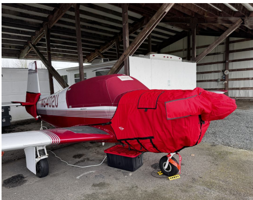
Mooney M20C Insulated Engine Cover, Fully Enclosed, Insulated Prop Cover