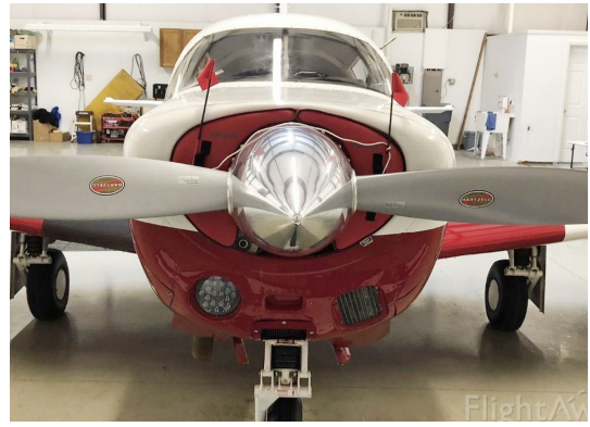
Mooney M20E Engine Inlet Plugs