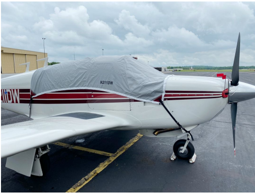
Mooney M20F Travel Weight Canopy Cover