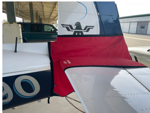
Mooney M20C Tailcone Cover