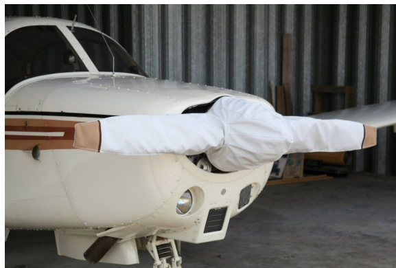
Mooney Early M20 Series Propellor/Spinner Cover, 2 Blade