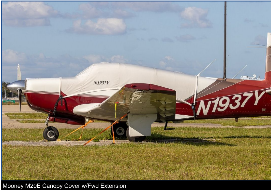
Mooney M20E Canopy Cover w/Fwd Extension