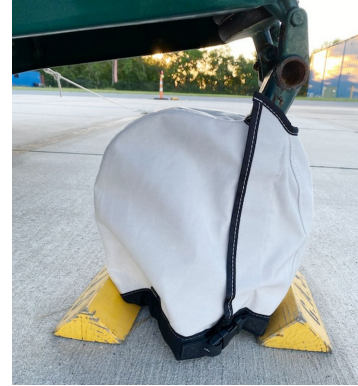
Mooney 201 Nose Wheel Cover