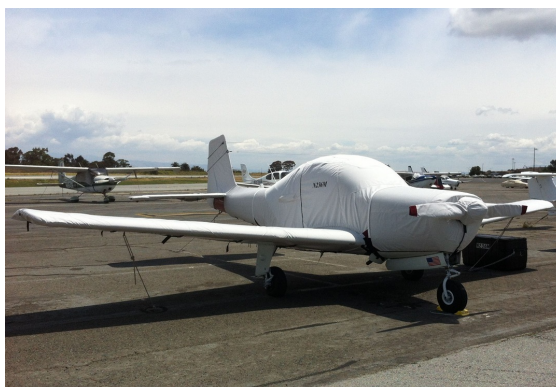
Meyers 200 Complete Cover Set

This cover type is made from Silver Acrylic Sunbrella canvas and is 100% lined with a soft and smooth microfiber. Bruce's Custom Covers developed this material combination especially for aircraft protection. The outer material is medium weight and treated for water resistance, UV resistance and anti-static buildup. The inner lining is a very soft and smooth microfiber to prevent scratching. The material is very reflective, and tests show that the cabin interior temperature can be reduced to near-ambient temperature on the hottest of days. It is water, ice and snow repellent, yet breathable to allow moisture to escape from between the cover and the aircraft surface.