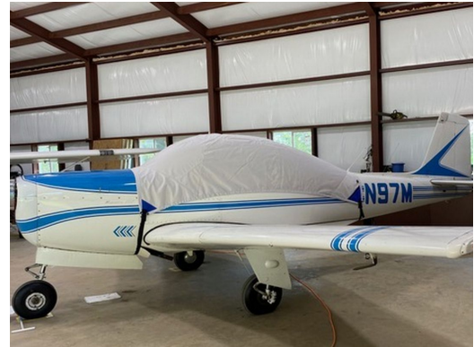
Meyers (Rockwell) 200 Canopy Cover