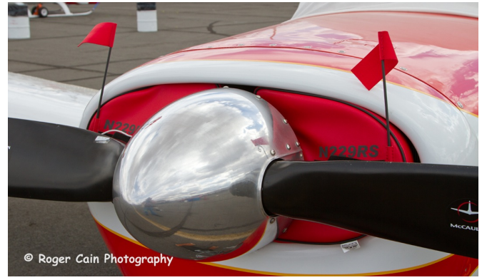
Meyer (Aero Commander) 200 Engine Plugs