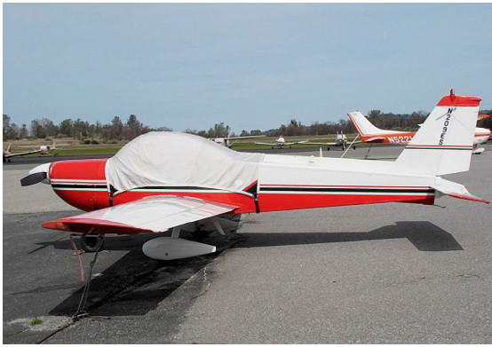
Messerschmitt BO-209 Monsoon Canopy Cover