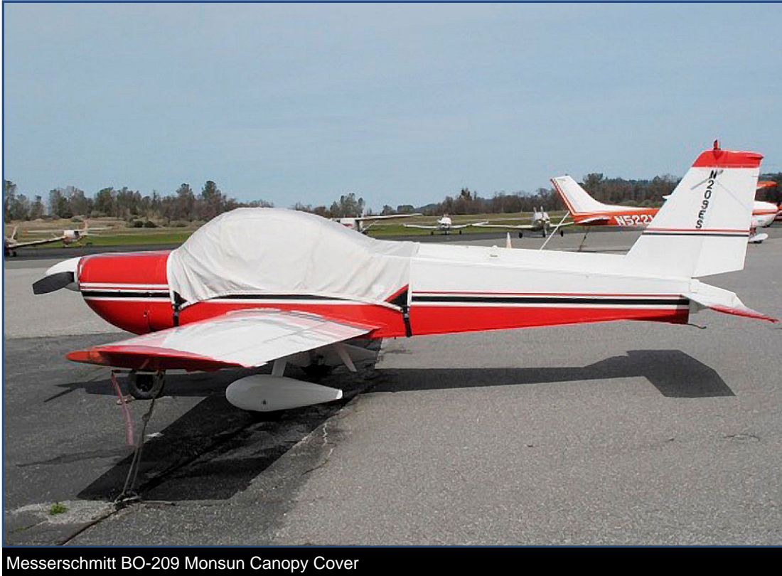
Messerschmitt BO-209 Monsun Canopy Cover