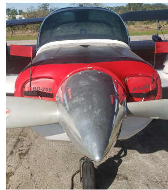
Messerschmitt BO-209 Monsun Engine Inlet Plugs