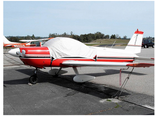
Messerschmitt BO-209 Monsoon Canopy Cover