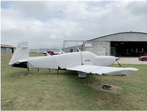
Mooney M20M Bravo Cover Set