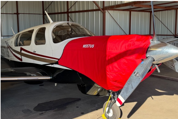
Mooney M20M, Insulated Engine Cover, doesn't cover gear well

This cover type is made from Silver Acrylic Sunbrella canvas and is 100% lined with a soft and smooth microfiber. Bruce's Custom Covers developed this material combination especially for aircraft protection. The outer material is medium weight and treated for water resistance, UV resistance and anti-static buildup. The inner lining is a very soft and smooth microfiber to prevent scratching. The material is very reflective, and tests show that the cabin interior temperature can be reduced to near-ambient temperature on the hottest of days. It is water, ice and snow repellent, yet breathable to allow moisture to escape from between the cover and the aircraft surface.