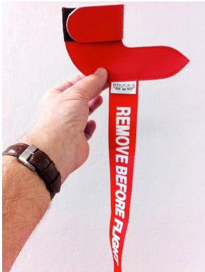
Standard Pitot Cover