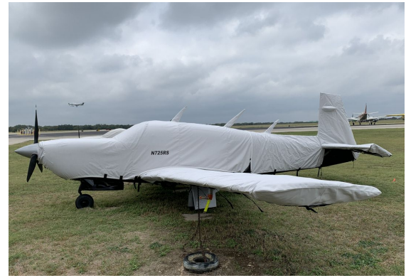
Mooney M20M Bravo Cover Set