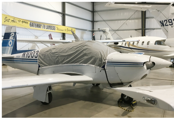
Mooney 201 Travel Cover, Light Weight Travel Canopy Cover, 5 Lbs