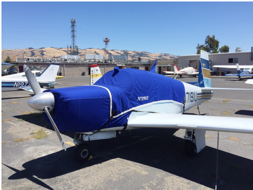
Mooney M20 Canopy & Engine Cover