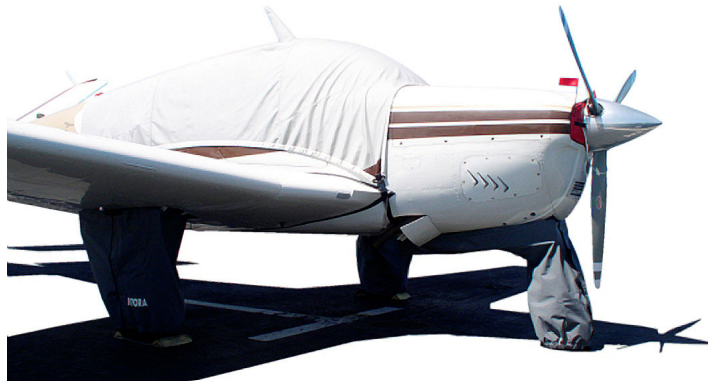
Beech Bonanza/Debonair/Baron Landing Gear Covers