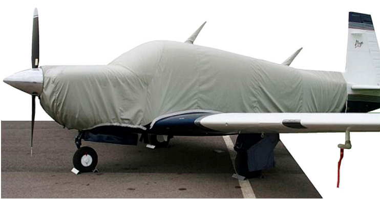
Mooney M20 Extra Extended Canopy/Engine Cover

This cover type is made from Silver Acrylic Sunbrella canvas and is 100% lined with a soft and smooth microfiber. Bruce's Custom Covers developed this material combination especially for aircraft protection. The outer material is medium weight and treated for water resistance, UV resistance and anti-static buildup. The inner lining is a very soft and smooth microfiber to prevent scratching. The material is very reflective, and tests show that the cabin interior temperature can be reduced to near-ambient temperature on the hottest of days. It is water, ice and snow repellent, yet breathable to allow moisture to escape from between the cover and the aircraft surface.