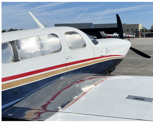
Mooney M20S Heatshield Set