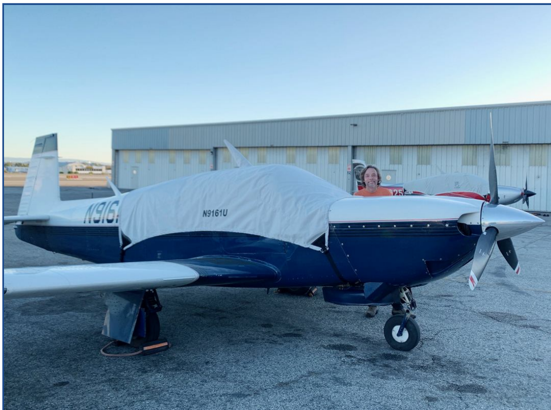
Mooney M20M Canopy Cover