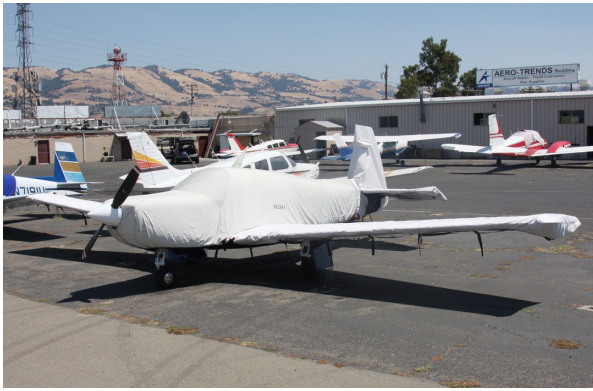
Mooney 231 Full Cover Set