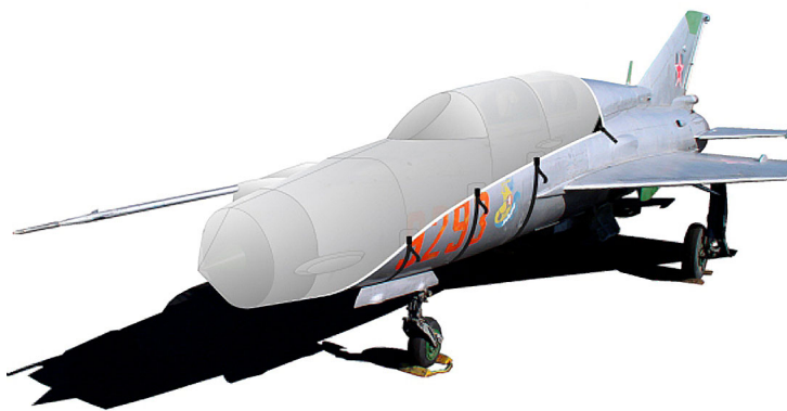
Mig 21 Canopy/Nose Cover

This cover type is made from Silver Acrylic Sunbrella canvas and is 100% lined with a soft and smooth microfiber. Bruce's Custom Covers developed this material combination especially for aircraft protection. The outer material is medium weight and treated for water resistance, UV resistance and anti-static buildup. The inner lining is a very soft and smooth microfiber to prevent scratching. The material is very reflective, and tests show that the cabin interior temperature can be reduced to near-ambient temperature on the hottest of days. It is water, ice and snow repellent, yet breathable to allow moisture to escape from between the cover and the aircraft surface.