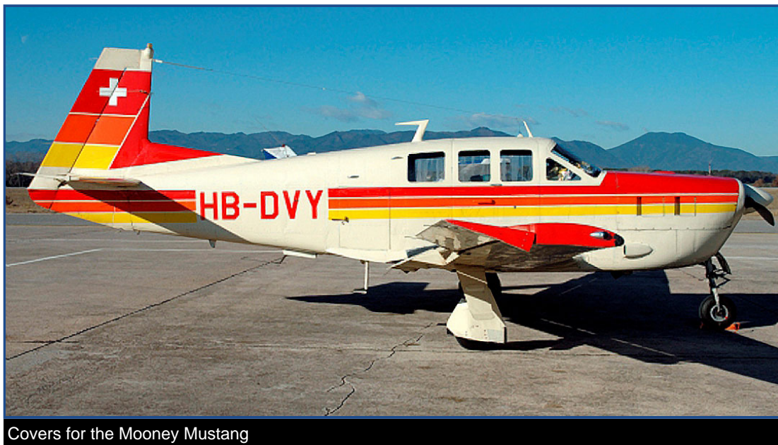
Covers for the Mooney Mustang