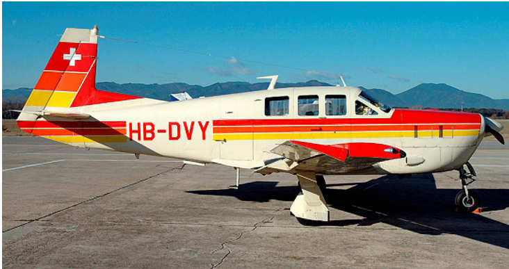
Covers for the Mooney Mustang

This cover type is made from Silver Acrylic Sunbrella canvas and is 100% lined with a soft and smooth microfiber. Bruce's Custom Covers developed this material combination especially for aircraft protection. The outer material is medium weight and treated for water resistance, UV resistance and anti-static buildup. The inner lining is a very soft and smooth microfiber to prevent scratching. The material is very reflective, and tests show that the cabin interior temperature can be reduced to near-ambient temperature on the hottest of days. It is water, ice and snow repellent, yet breathable to allow moisture to escape from between the cover and the aircraft surface.