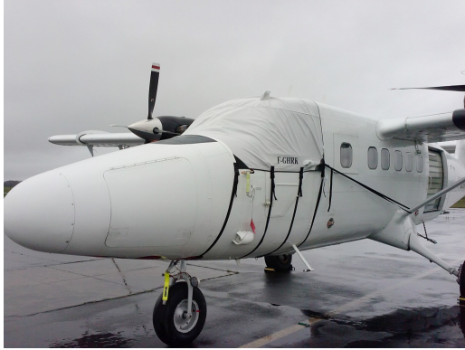
Twin Otter Cockpit Cover

This cover type is made from Silver Acrylic Sunbrella canvas and is 100% lined with a soft and smooth microfiber. Bruce's Custom Covers developed this material combination especially for aircraft protection. The outer material is medium weight and treated for water resistance, UV resistance and anti-static buildup. The inner lining is a very soft and smooth microfiber to prevent scratching. The material is very reflective, and tests show that the cabin interior temperature can be reduced to near-ambient temperature on the hottest of days. It is water, ice and snow repellent, yet breathable to allow moisture to escape from between the cover and the aircraft surface.