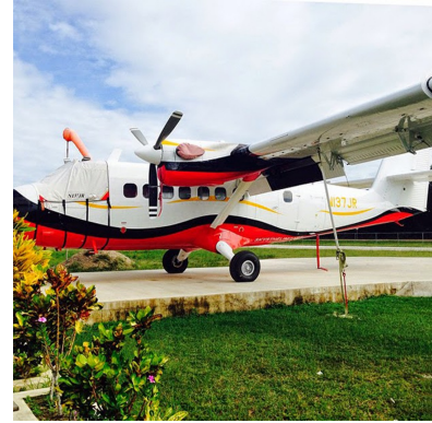
Twin Otter Cockpit Cover & Engine Plugs