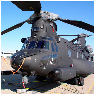
Boeing Vertol MH-47 Rotor Hubs, Engine & Other Covers

Insulated Covers Material - A special composite material of solution-dyed polyester, 3M Thinsulate insulation, and soft nylon interior fabric. Our insulated covers are designed to complement an engine preheater and help retain heat in the engine compartment after shutdown. If you operate your aircraft in cold-weather, these covers will help prevent engine wear and tear.