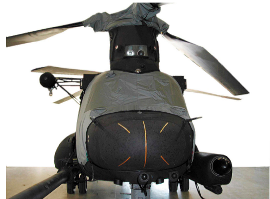
Boeing Vertol CH-47 Forward Cabin & Rotor Hub Cover