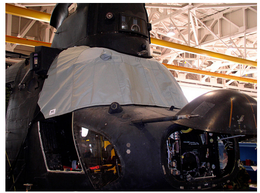
Boeing Vertol CH-47 Windshield/Cockpit Cover