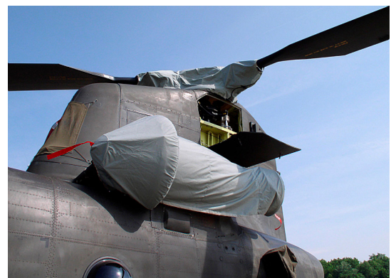
Boeing Vertol CH-47 Engine and Rotor Hub Covers