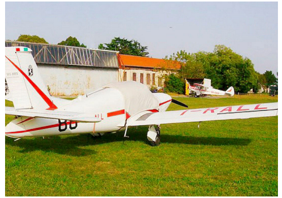
Standard Canopy Cover for MS893A