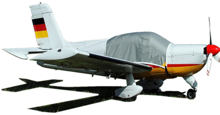
Rallye 150 Canopy Cover