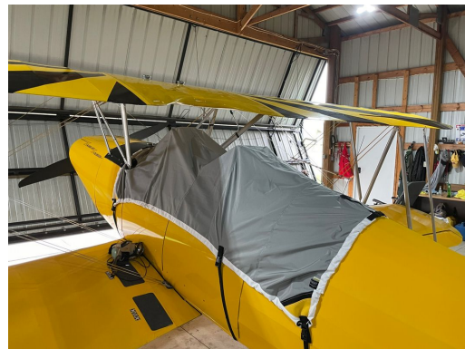
Marquardt Charger Travel Weight Canopy Cover