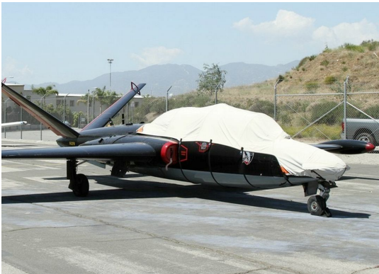
Fouga Magister Canopy/Nose Cover with nose mount loop antenna