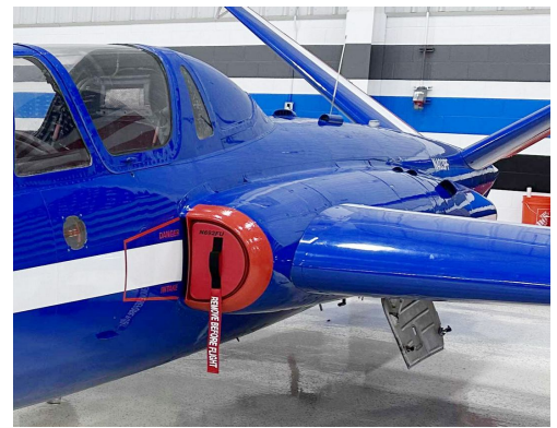
Fougas Magister CM170 Intake Plugs