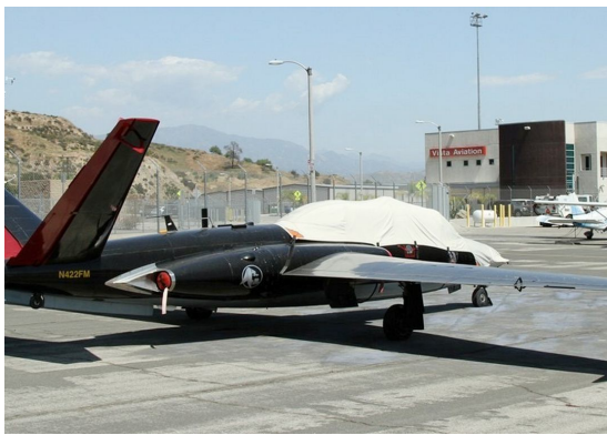
Fougas Magister Canopy/Nose Cover with nose mount loop antenna