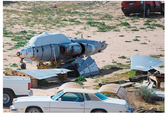
Fouga Magister Canopy Cover