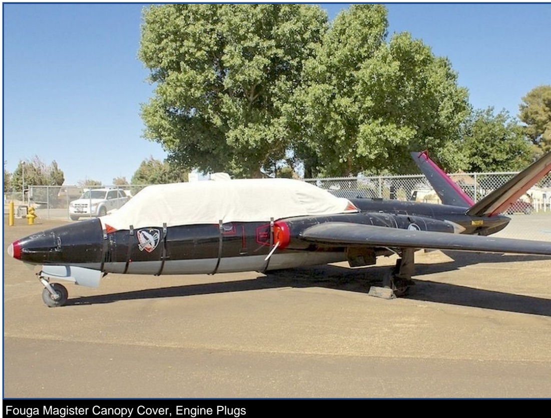
Fouga Magister Canopy Cover, Engine Plugs