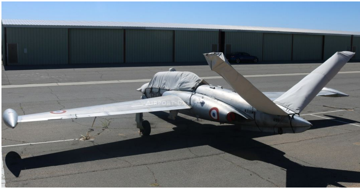
Fouga Magister Canopy/Nose Cover, Tail Stabilizer Covers