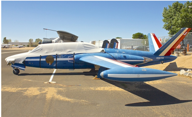
Fouga Magister Canopy/Nose Cover

Travel Covers are made with Silver Solution-Dyed Polyester fabric and only lined over the windshield to save weight. The material is lightweight and more compact for easy stowage in the aircraft. The polyester material is water resistant, but only intended for occasional use outside. We also have an ultra lightweight material available for fitted hangar dust covers. For daily outdoor use, the non-travel Sunbrella Cover is the best choice.