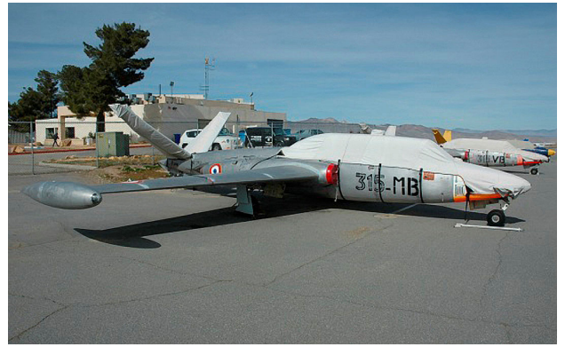
Fouga Magister Canopy/Nose Cover & Tail Stabilizer Covers