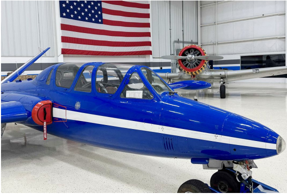
Fouga Magister CM170 Intake Plugs