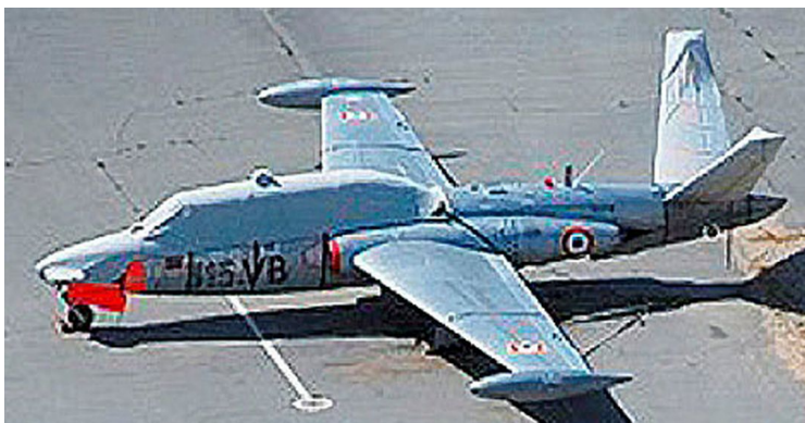
Fougas Magister Canopy/Nose & Stabilizer Covers

WINTER USE MATERIAL - Made with Solution-Dyed Polyester fabric, this option is intended for seasonal use to aid in deicing, rain mitigation, or for occasional travel. The material is lighter and more compact, but more susceptible to UV damage and may have a shorter useful life if used continuously outside than the all-year use material.