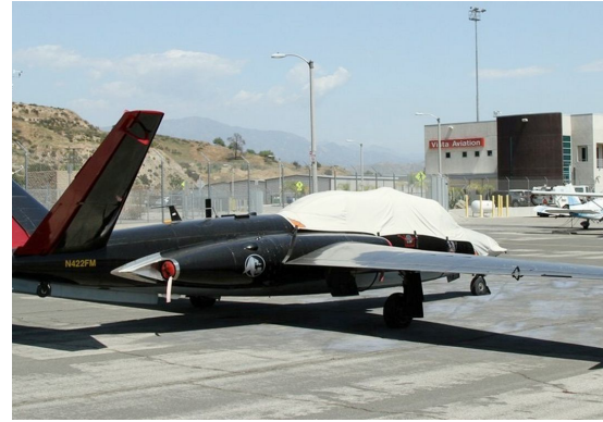
Fouga Magister Canopy/Nose Cover with nose mount loop antenna