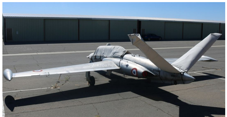
Fougas Magister Canopy/Nose Cover, Tail Stabilizer Covers