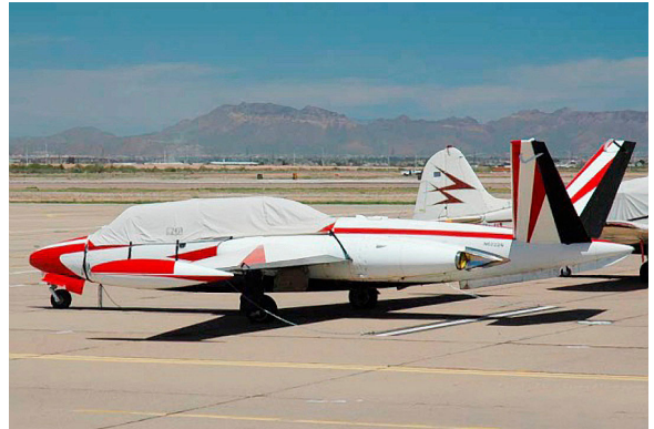
Fouga Magister Canopy Cover