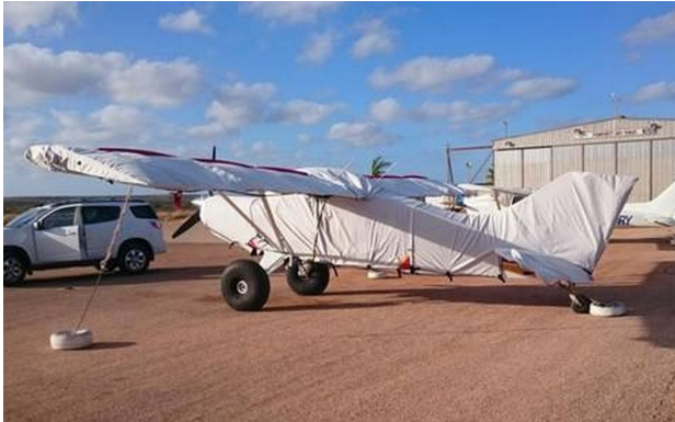
Maule M7-235 Extended Canopy, Wing, Engine & Empennage Covers

This cover type is made from Silver Acrylic Sunbrella canvas and is 100% lined with a soft and smooth microfiber. Bruce's Custom Covers developed this material combination especially for aircraft protection. The outer material is medium weight and treated for water resistance, UV resistance and anti-static buildup. The inner lining is a very soft and smooth microfiber to prevent scratching. The material is very reflective, and tests show that the cabin interior temperature can be reduced to near-ambient temperature on the hottest of days. It is water, ice and snow repellent, yet breathable to allow moisture to escape from between the cover and the aircraft surface.