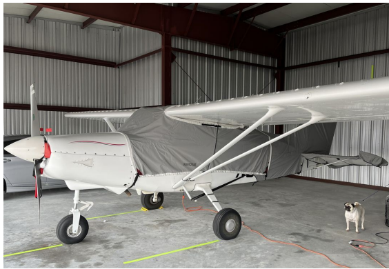
Maule MXT-7-180 Canopy & Empennage Covers, travel weight

WINTER USE MATERIAL - Made with Solution-Dyed Polyester fabric, this option is intended for seasonal use to aid in deicing, rain mitigation, or for occasional travel. The material is lighter and more compact, but more susceptible to UV damage and may have a shorter useful life if used continuously outside than the all-year use material.