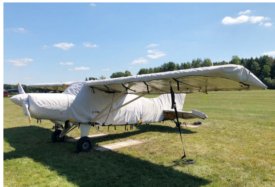
Maule Complete Cover Set