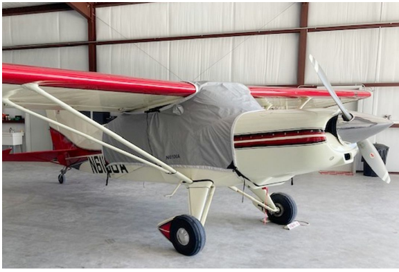
Maule M5-180C Travel Weight Canopy Cover