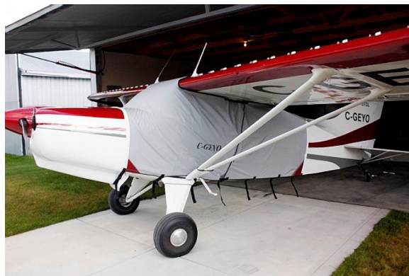
Maule Over-Top Extended Canopy Cover