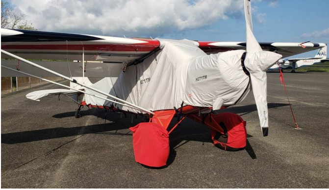
Aviat Husky Extended Canopy Cover, Engine, Prop, Empennage & Tire Covers

The Maule (All Models) Tailcone Cover fits onto the tailcone area to cover the holes that birds can fly into and nest. The cover easily straps onto the leading edge of the horizontal stabilizer with padded hooks or overlaps with the elevators slightly and attaches under the horizontal stabilizers with adjustable straps. Tailcone Covers are normally made with Solution-Dyed Polyester or Acrylic Sunbrella.