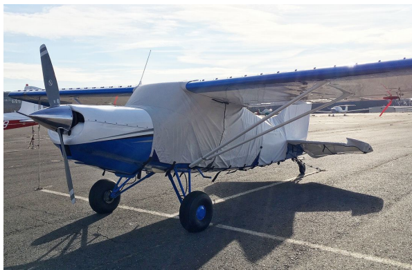
Maule M-5-235C Extended Canopy Cover, Empennage Cover