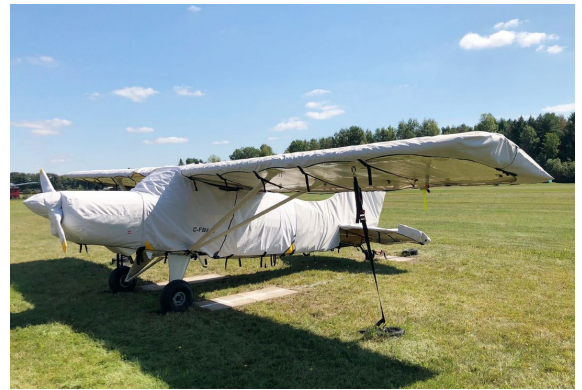
Maule Complete Cover Set