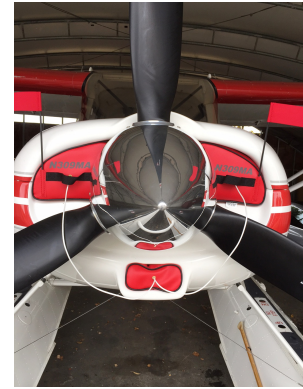
Maule Engine Inlet Plugs