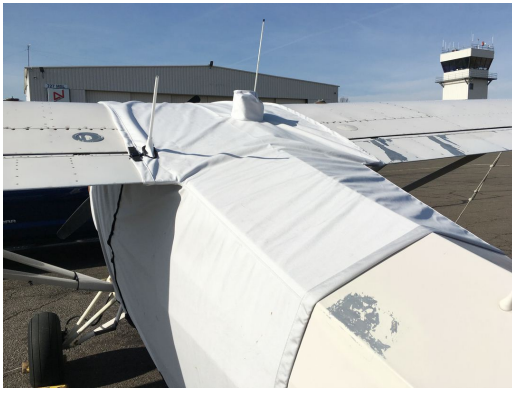
Maule M-5-235C Extended Canopy Cover