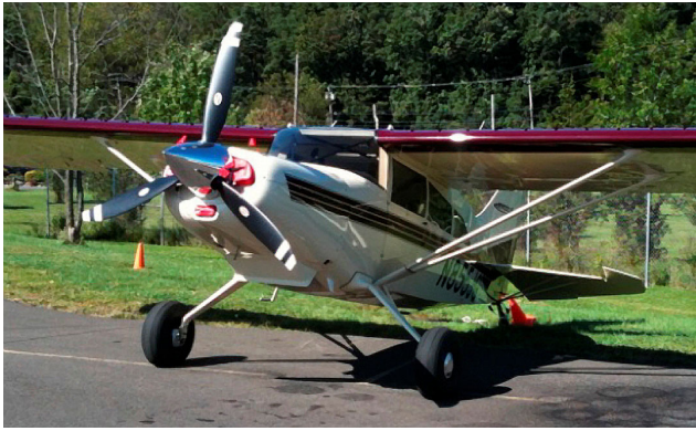
Maule Engine Inlet Plugs

inserted after flight when the engine is still warm. Engine Inlet Plugs are commonly referred to as Cowl Plugs, Intake Plugs, Cowl Blocks, Engine Blocks, and Engine Bungs.