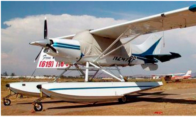
Maule Over-The-Top Canopy Cover