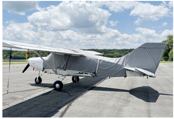
Maule MXT-7-180 Canopy & Empennage Covers, travel weight