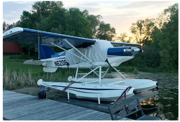
Maule M5 Over-Top Canopy Cover w/6" wing root extensions