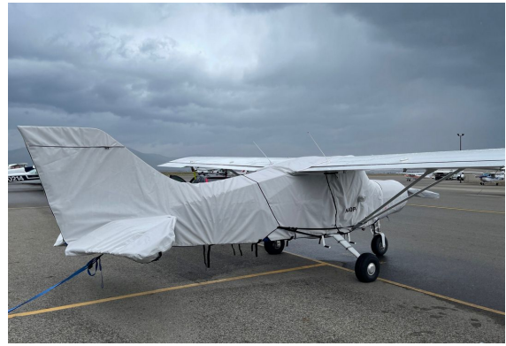
Maule MX7-180 Prop, Engine, Extended Canopy & Empennage Covers