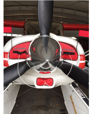
Maule Engine Inlet Plugs