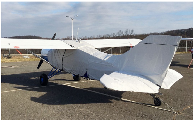
Maule M-5-235C Extended Canopy Cover, Empennage Cover

WINTER USE MATERIAL - Made with Solution-Dyed Polyester fabric, this option is intended for seasonal use to aid in deicing, rain mitigation, or for occasional travel. The material is lighter and more compact, but more susceptible to UV damage and may have a shorter useful life if used continuously outside than the all-year use material.