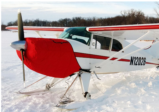
Maule (All Models) Engine Cover, M-4/5-220c Models (Insulated)

This cover type is made from Silver Acrylic Sunbrella canvas and is 100% lined with a soft and smooth microfiber. Bruce's Custom Covers developed this material combination especially for aircraft protection. The outer material is medium weight and treated for water resistance, UV resistance and anti-static buildup. The inner lining is a very soft and smooth microfiber to prevent scratching. The material is very reflective, and tests show that the cabin interior temperature can be reduced to near-ambient temperature on the hottest of days. It is water, ice and snow repellent, yet breathable to allow moisture to escape from between the cover and the aircraft surface.