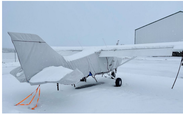
Maule MX7-180 Extended Canopy Cover, Engine, Prop & Empennage Covers.