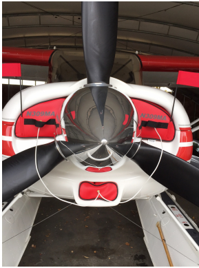
Maule Engine Inlet Plugs

have warning flags that are visible from the cockpit or 'remove before flight' streamers sewn onto the face of the plugs. Most plugs are imprinted with the aircraft registration number in black for an extra charge. Storage bag NOT included. Engine plugs may be inserted after flight when the engine is still warm. Engine Inlet Plugs are commonly referred to as Cowl Plugs, Intake Plugs, Cowl Blocks, Engine Blocks, and Engine Bungs.