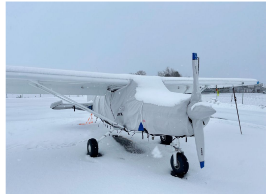
Maule MX7-180 Extended Canopy Cover, Engine, Prop & Empennage Covers.