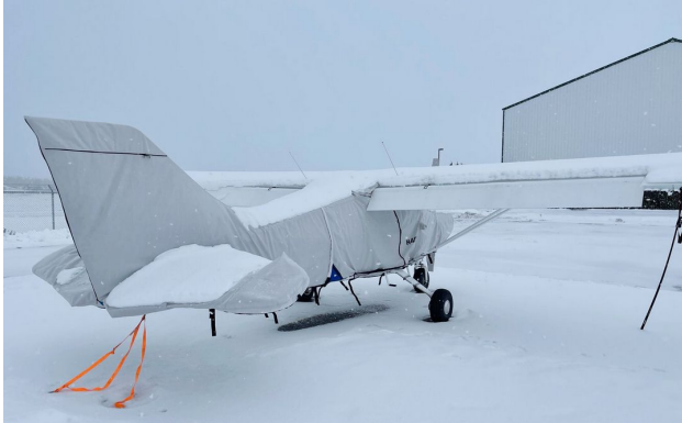
Maule MX7-180 Extended Canopy Cover, Engine, Prop & Empennage Covers.

This cover type is made from Silver Acrylic Sunbrella canvas and is 100% lined with a soft and smooth microfiber. Bruce's Custom Covers developed this material combination especially for aircraft protection. The outer material is medium weight and treated for water resistance, UV resistance and anti-static buildup. The inner lining is a very soft and smooth microfiber to prevent scratching. The material is very reflective, and tests show that the cabin interior temperature can be reduced to near-ambient temperature on the hottest of days. It is water, ice and snow repellent, yet breathable to allow moisture to escape from between the cover and the aircraft surface.