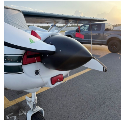
Maule Engine Inlet Plugs, set of 3