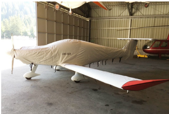
Dynaero MCR.4 Pickup Complete Cover Set.

This cover type is made from Silver Acrylic Sunbrella canvas and is 100% lined with a soft and smooth microfiber. Bruce's Custom Covers developed this material combination especially for aircraft protection. The outer material is medium weight and treated for water resistance, UV resistance and anti-static buildup. The inner lining is a very soft and smooth microfiber to prevent scratching. The material is very reflective, and tests show that the cabin interior temperature can be reduced to near-ambient temperature on the hottest of days. It is water, ice and snow repellent, yet breathable to allow moisture to escape from between the cover and the aircraft surface.