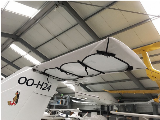
Dynaero MCR Horizontal Stabilizer Cover

WINTER USE MATERIAL - Made with Solution-Dyed Polyester fabric, this option is intended for seasonal use to aid in deicing, rain mitigation, or for occasional travel. The material is lighter and more compact, but more susceptible to UV damage and may have a shorter useful life if used continuously outside than the all-year use material.