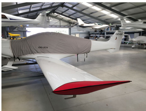
Dynaero MCR.4 Pickup Canopy Cover, Wingtip Pads