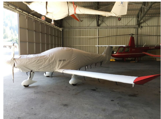
Dynaero MCR.4 Pickup Complete Cover Set.