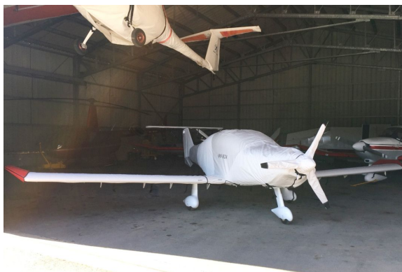
Dynaero MCR.4 Pickup Complete Cover Set.