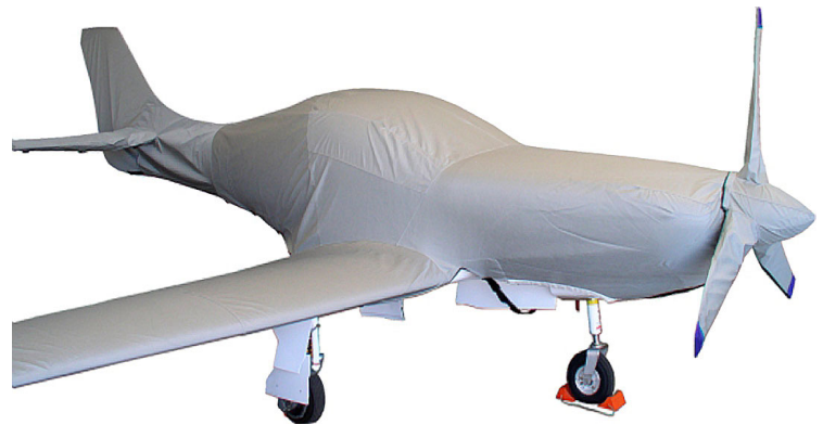
Lancair 320 Complete Fuselage/Wing Cover & Prop Cover