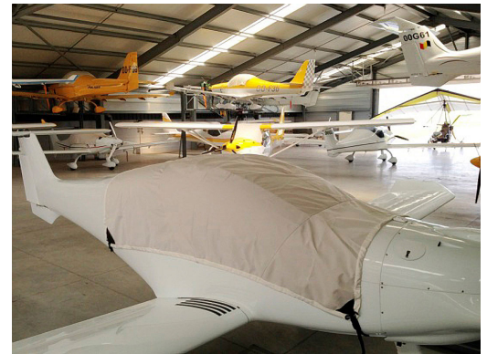
Dynaero MCR Pickup Canopy Cover