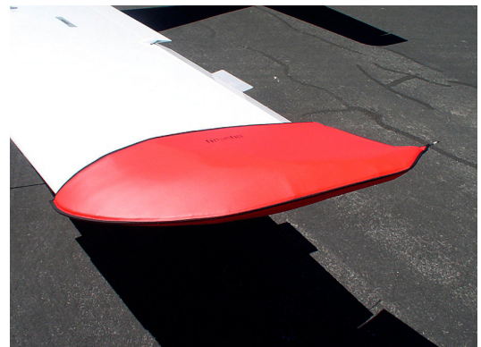
Cessna 350/400 Wingtip Pads