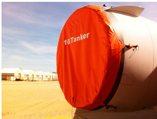
DC-10-30 Intake Cover (CF650C2 Engine)