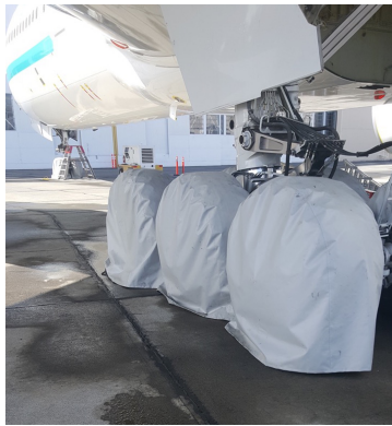
Boeing 777 Main & Nose Gear Tire Covers

ALL-YEAR USE MATERIAL - Made with Silver Acrylic Sunbrella canvas, the all-year use material is the best option for sun protection and cover longevity. This heavier more durable material is intended for all weather conditions, such as rain and snow or lots of sun.