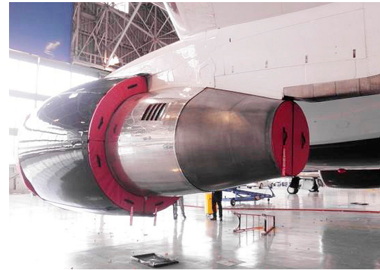
Exhaust Plugs Ship Set, incl. Fan Thrust Reverser and Exhaust Plugs P/N: B767-200