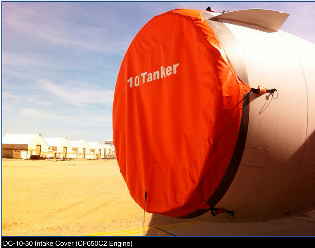
DC-10-30 Intake Cover (CF650C2 Engine)