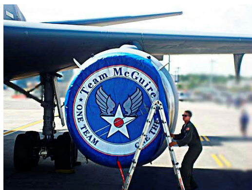
McDonnell Douglas KC-10 Intake Cover