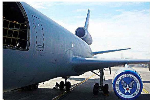
KC-10 Intake Cover at McGuire AFB, NJ