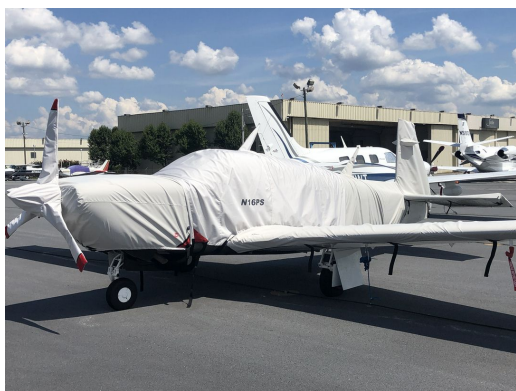
Mooney M20TN Acclaim Full Cover Set

WINTER USE MATERIAL - Made with Solution-Dyed Polyester fabric, this option is intended for seasonal use to aid in deicing, rain mitigation, or for occasional travel. The material is lighter and more compact, but more susceptible to UV damage and may have a shorter useful life if used continuously outside than the all-year use material.