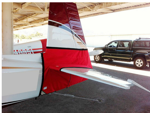
Mooney Tailcone Cover, completely enclosed

WINTER USE MATERIAL - Made with Solution-Dyed Polyester fabric, this option is intended for seasonal use to aid in deicing, rain mitigation, or for occasional travel. The material is lighter and more compact, but more susceptible to UV damage and may have a shorter useful life if used continuously outside than the all-year use material.