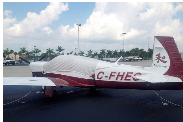
Mooney TLS Canopy Cover