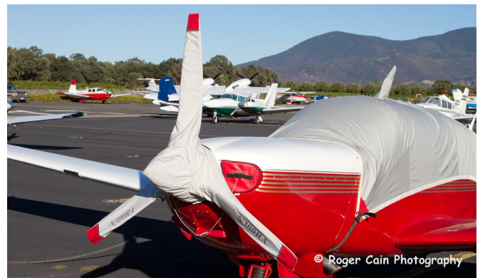
Mooney TLS/Acclaim Fully Enclosed Insulated Engine Cover, 3D model Mooney M20M Bravo 3-Blade Prop Cover, Engine Plugs