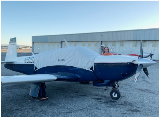
Mooney M20M Canopy Cover