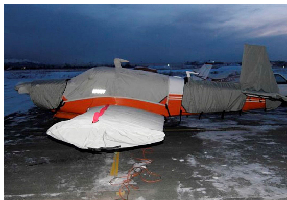
Mooney Prop/Spinner, Insulated Engine, Wing, Canopy and Empennage Covers