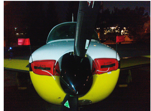
Mooney 231 Engine Inlet Plugs