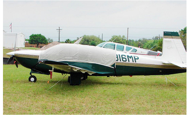
Mooney Ovation Canopy Cover