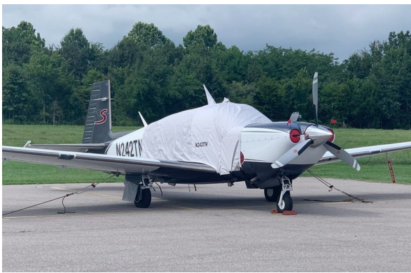
Mooney M20TN Extended Canopy Cover

This cover type is made from Silver Acrylic Sunbrella canvas and is 100% lined with a soft and smooth microfiber. Bruce's Custom Covers developed this material combination especially for aircraft protection. The outer material is medium weight and treated for water resistance, UV resistance and anti-static buildup. The inner lining is a very soft and smooth microfiber to prevent scratching. The material is very reflective, and tests show that the cabin interior temperature can be reduced to near-ambient temperature on the hottest of days. It is water, ice and snow repellent, yet breathable to allow moisture to escape from between the cover and the aircraft surface.