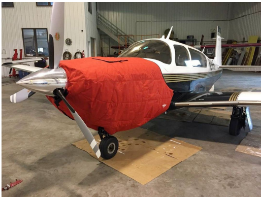
Mooney Ovation Insulated Engine Cover

This cover type is made from Silver Acrylic Sunbrella canvas and is 100% lined with a soft and smooth microfiber. Bruce's Custom Covers developed this material combination especially for aircraft protection. The outer material is medium weight and treated for water resistance, UV resistance and anti-static buildup. The inner lining is a very soft and smooth microfiber to prevent scratching. The material is very reflective, and tests show that the cabin interior temperature can be reduced to near-ambient temperature on the hottest of days. It is water, ice and snow repellent, yet breathable to allow moisture to escape from between the cover and the aircraft surface.