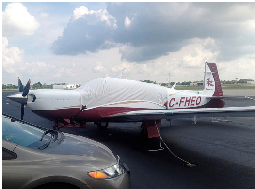
Mooney TLS Canopy Cover

This cover type is made from Silver Acrylic Sunbrella canvas and is 100% lined with a soft and smooth microfiber. Bruce's Custom Covers developed this material combination especially for aircraft protection. The outer material is medium weight and treated for water resistance, UV resistance and anti-static buildup. The inner lining is a very soft and smooth microfiber to prevent scratching. The material is very reflective, and tests show that the cabin interior temperature can be reduced to near-ambient temperature on the hottest of days. It is water, ice and snow repellent, yet breathable to allow moisture to escape from between the cover and the aircraft surface.