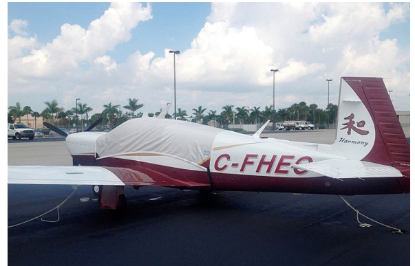
Mooney TLS Canopy Cover