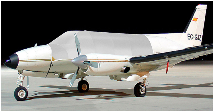
Merlin Canopy Cover (illustration)

This cover type is made from Silver Acrylic Sunbrella canvas and is 100% lined with a soft and smooth microfiber. Bruce's Custom Covers developed this material combination especially for aircraft protection. The outer material is medium weight and treated for water resistance, UV resistance and anti-static buildup. The inner lining is a very soft and smooth microfiber to prevent scratching. The material is very reflective, and tests show that the cabin interior temperature can be reduced to near-ambient temperature on the hottest of days. It is water, ice and snow repellent, yet breathable to allow moisture to escape from between the cover and the aircraft surface.