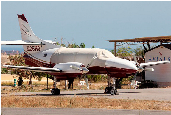
Merlin Canopy Cover

Travel Covers are made with Silver Solution-Dyed Polyester fabric and only lined over the windshield to save weight. The material is lightweight and more compact for easy stowage in the aircraft. The polyester material is water resistant, but only intended for occasional use outside. We also have an ultra lightweight material available for fitted hangar dust covers. For daily outdoor use, the non-travel Sunbrella Cover is the best choice.