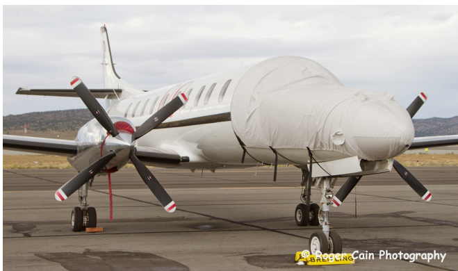
Merlin Cockpit/Nose Cover

This cover type is made from Silver Acrylic Sunbrella canvas and is 100% lined with a soft and smooth microfiber. Bruce's Custom Covers developed this material combination especially for aircraft protection. The outer material is medium weight and treated for water resistance, UV resistance and anti-static buildup. The inner lining is a very soft and smooth microfiber to prevent scratching. The material is very reflective, and tests show that the cabin interior temperature can be reduced to near-ambient temperature on the hottest of days. It is water, ice and snow repellent, yet breathable to allow moisture to escape from between the cover and the aircraft surface.