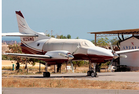
Merlin Canopy Cover

Travel Covers are made with Silver Solution-Dyed Polyester fabric and only lined over the windshield to save weight. The material is lightweight and more compact for easy stowage in the aircraft. The polyester material is water resistant, but only intended for occasional use outside. We also have an ultra lightweight material available for fitted hangar dust covers. For daily outdoor use, the non-travel Sunbrella Cover is the best choice.