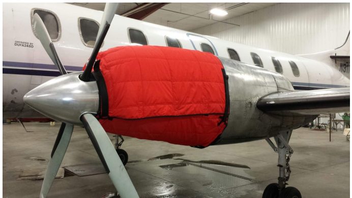
Merlin Insulated Engine Covers