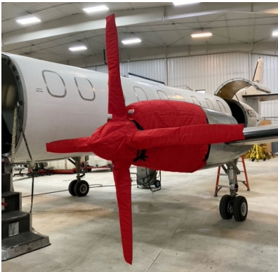
Fairchild Merlin Insulated Engine & Prop Covers

This cover type is made from Silver Acrylic Sunbrella canvas and is 100% lined with a soft and smooth microfiber. Bruce's Custom Covers developed this material combination especially for aircraft protection. The outer material is medium weight and treated for water resistance, UV resistance and anti-static buildup. The inner lining is a very soft and smooth microfiber to prevent scratching. The material is very reflective, and tests show that the cabin interior temperature can be reduced to near-ambient temperature on the hottest of days. It is water, ice and snow repellent, yet breathable to allow moisture to escape from between the cover and the aircraft surface.