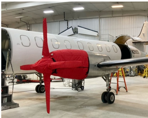
Fairchild Merlin Insulated Engine & Prop Covers

This cover type is made from Silver Acrylic Sunbrella canvas and is 100% lined with a soft and smooth microfiber. Bruce's Custom Covers developed this material combination especially for aircraft protection. The outer material is medium weight and treated for water resistance, UV resistance and anti-static buildup. The inner lining is a very soft and smooth microfiber to prevent scratching. The material is very reflective, and tests show that the cabin interior temperature can be reduced to near-ambient temperature on the hottest of days. It is water, ice and snow repellent, yet breathable to allow moisture to escape from between the cover and the aircraft surface.