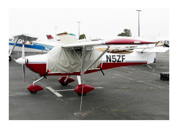
Eurofox Canopy Cover