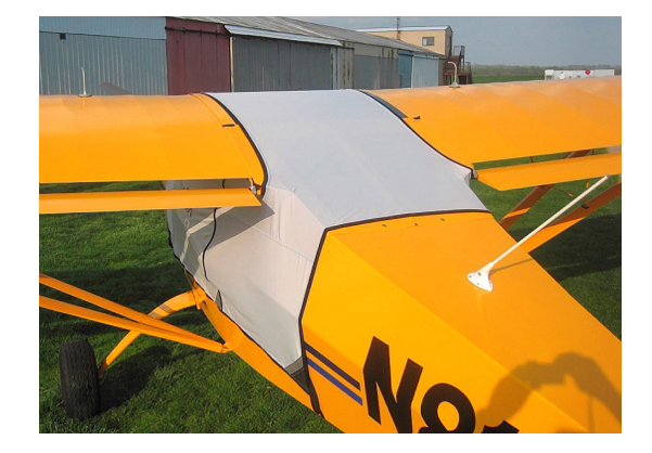
Aerotrek A240 Spandex FlyAway Travel Canopy Cover

Travel Covers are made with Silver Solution-Dyed Polyester fabric and only lined over the windshield to save weight. The material is lightweight and more compact for easy stowage in the aircraft. The polyester material is water resistant, but only intended for occasional use outside. We also have an ultra lightweight material available for fitted hangar dust covers. For daily outdoor use, the non-travel Sunbrella Cover is the best choice.