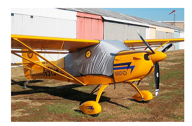
Aerotrek A220 Fitted Hangar Dust Cover