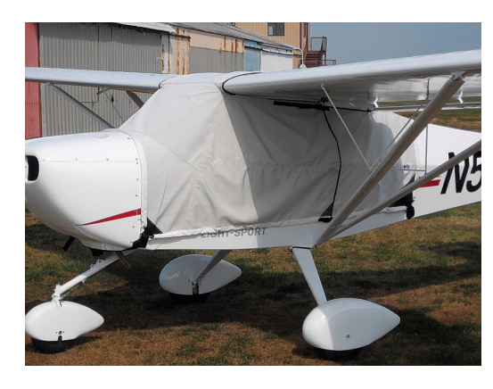
Aerotrek A240 Standard Canopy Cover

This cover type is made from Silver Acrylic Sunbrella canvas and is 100% lined with a soft and smooth microfiber. Bruce's Custom Covers developed this material combination especially for aircraft protection. The outer material is medium weight and treated for water resistance, UV resistance and anti-static buildup. The inner lining is a very soft and smooth microfiber to prevent scratching. The material is very reflective, and tests show that the cabin interior temperature can be reduced to near-ambient temperature on the hottest of days. It is water, ice and snow repellent, yet breathable to allow moisture to escape from between the cover and the aircraft surface.