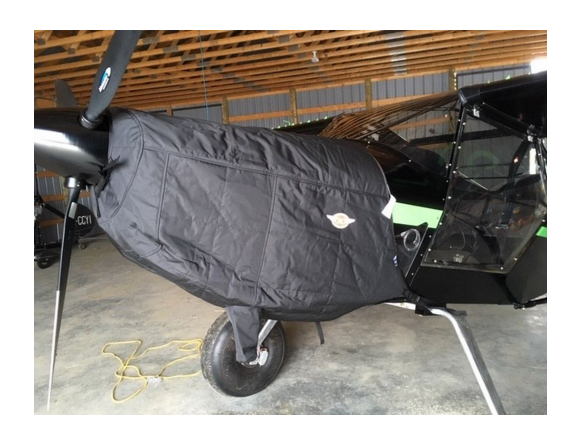
Kitfox V Insulated Engine Cover