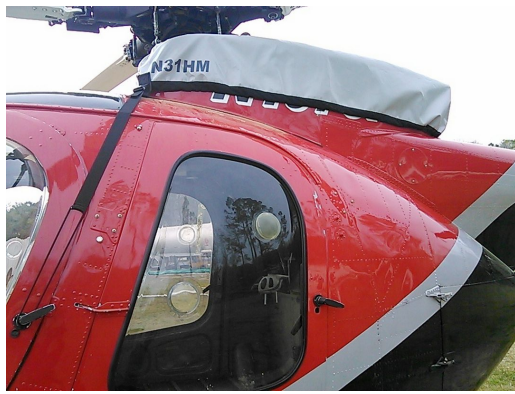
Customized Engine Cover