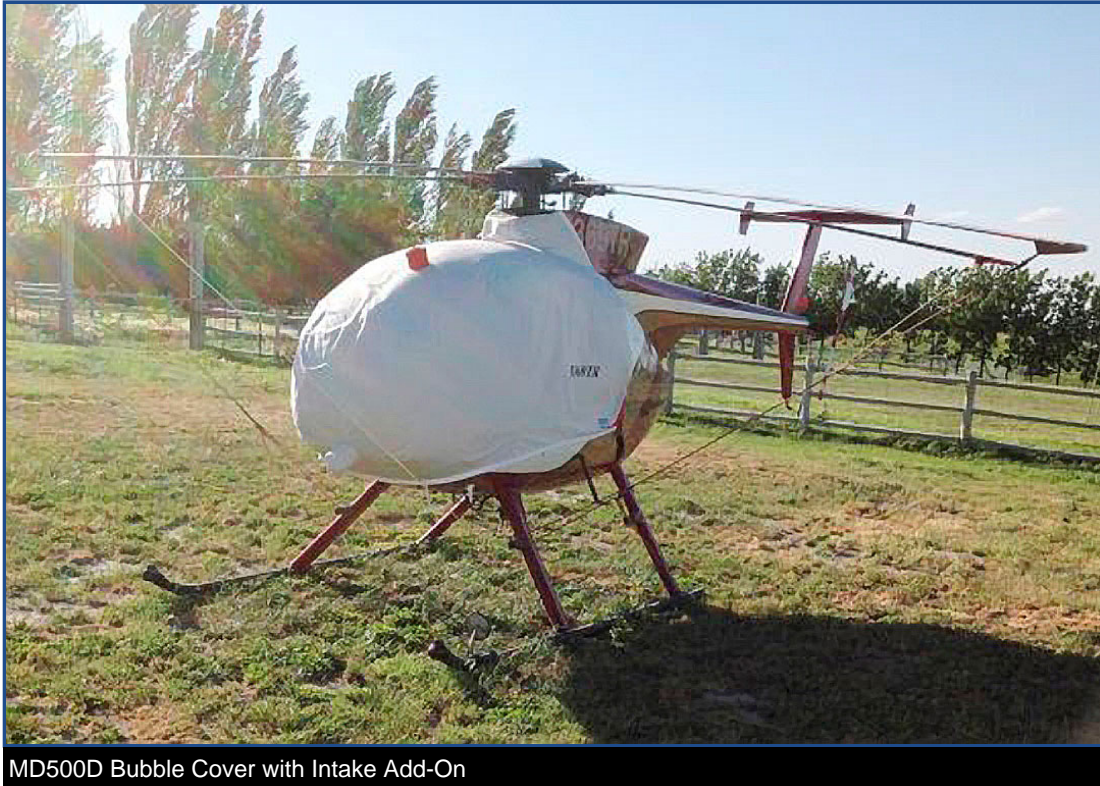
MD500D Bubble Cover with Intake Add-On