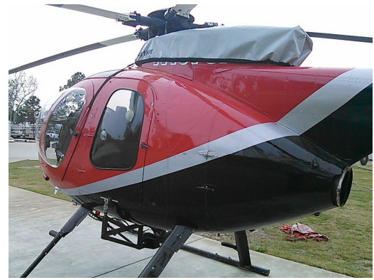
Customized Engine Cover