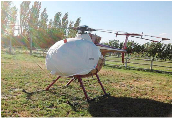
MD500D Bubble Cover with Intake Add-On