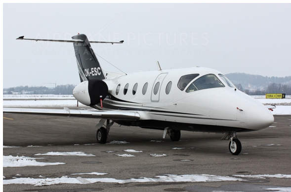
Nextant 400XTi Bikini Type Engine Covers