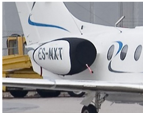
Nextant 400XTi Bikini Type Engine Covers