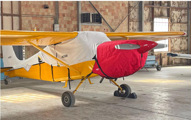
Murphy Super Rebel Insulated Engine Cover

This cover type is made from Silver Acrylic Sunbrella canvas and is 100% lined with a soft and smooth microfiber. Bruce's Custom Covers developed this material combination especially for aircraft protection. The outer material is medium weight and treated for water resistance, UV resistance and anti-static buildup. The inner lining is a very soft and smooth microfiber to prevent scratching. The material is very reflective, and tests show that the cabin interior temperature can be reduced to near-ambient temperature on the hottest of days. It is water, ice and snow repellent, yet breathable to allow moisture to escape from between the cover and the aircraft surface.