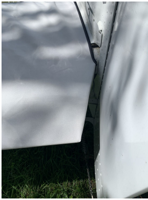
Murphy Elite Horizontal Stabilizer Covers