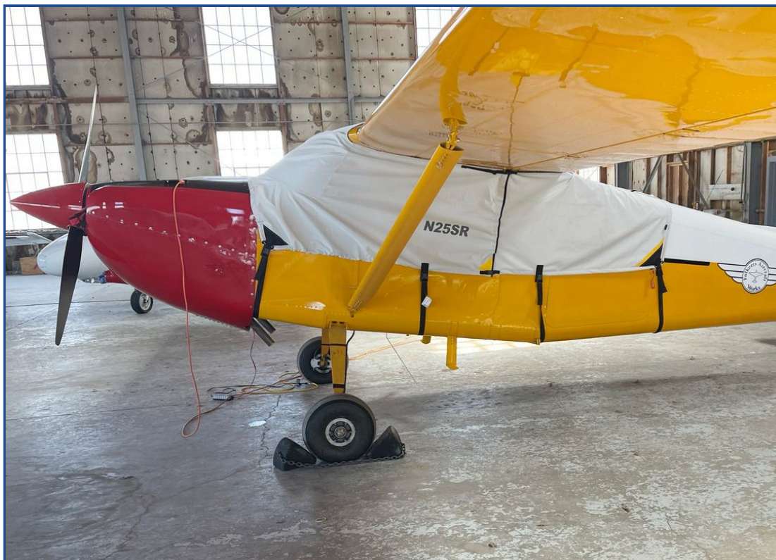
Murphy Super Rebel Canopy Cover