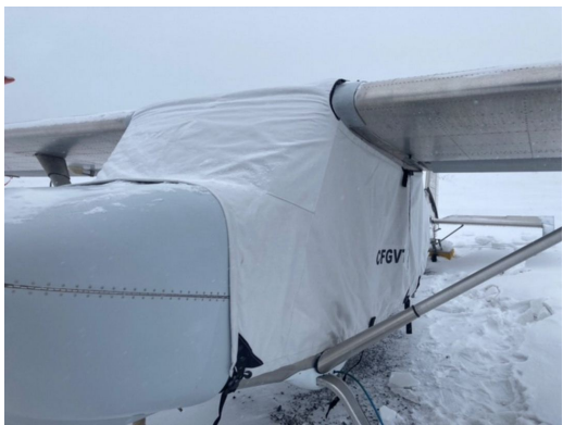
Murphy Rebel Canopy Cover, Over-Top Type

This cover type is made from Silver Acrylic Sunbrella canvas and is 100% lined with a soft and smooth microfiber. Bruce's Custom Covers developed this material combination especially for aircraft protection. The outer material is medium weight and treated for water resistance, UV resistance and anti-static buildup. The inner lining is a very soft and smooth microfiber to prevent scratching. The material is very reflective, and tests show that the cabin interior temperature can be reduced to near-ambient temperature on the hottest of days. It is water, ice and snow repellent, yet breathable to allow moisture to escape from between the cover and the aircraft surface.