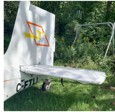
Murphy Elite Horizontal Stabilizer Covers