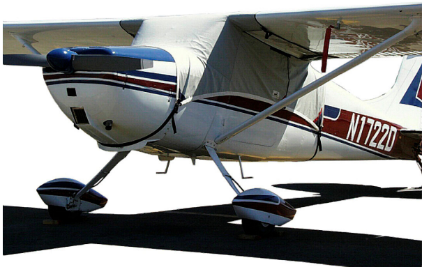
Over-the-Top Canopy Cover

Covers developed this material combination especially for aircraft protection. The outer material is medium weight and treated for water resistance, UV resistance and anti-static buildup. The inner lining is a very soft and smooth microfiber to prevent scratching. The material is very reflective, and tests show that the cabin interior temperature can be reduced to near-ambient temperature on the hottest of days. It is water, ice and snow repellent, yet breathable to allow moisture to escape from between the cover and the aircraft surface.