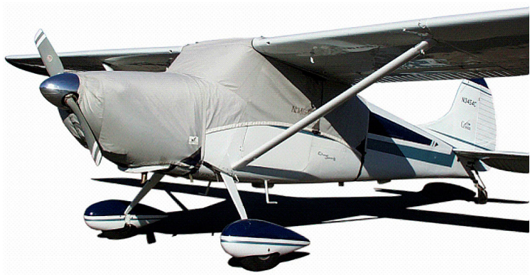
Cessna 170 Canopy Cover & Engine Cover