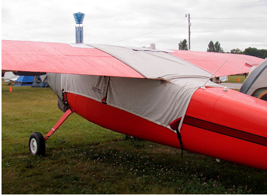
Over-Top Canopy Cover & Engine Cover

The material is very reflective, and tests show that the cabin interior temperature can be reduced to near-ambient temperature on the hottest of days. It is water, ice and snow repellent, yet breathable to allow moisture to escape from between the cover and the aircraft surface.