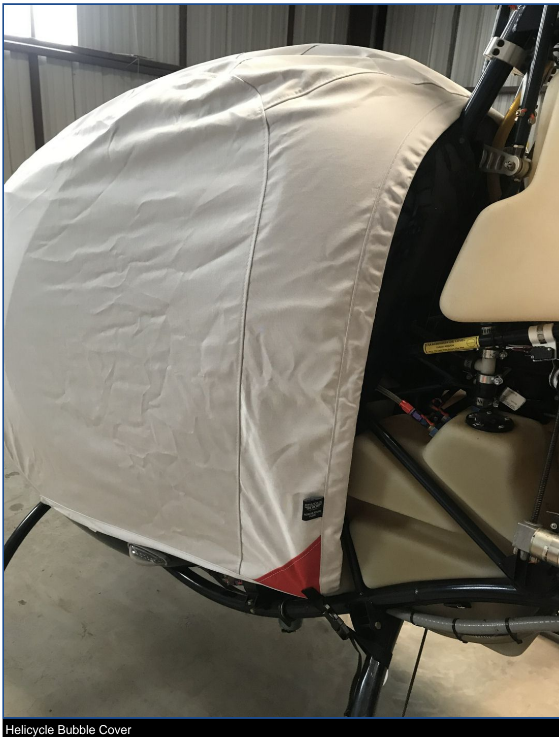
Helicycle Bubble Cover