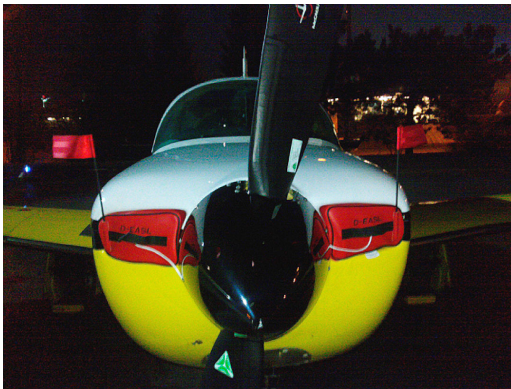
Mooney 231 Engine Inlet Plugs

Engine Inlet Plugs are custom fit for your Mooney Ovation & Ovation Ultra intakes, made with heavy-duty vinyl material, and stuffed with a single block of sculpted urethane foam. Each plug has a zipper that allows the foam to be removed and dried if necessary. Engine plugs have warning flags that are visible from the cockpit or 'remove before flight' streamers sewn onto the face of the plugs. Most plugs are imprinted with the aircraft registration number in black for an extra charge. Storage bag NOT included. Engine plugs may be inserted after flight when the engine is still warm. Engine Inlet Plugs are commonly referred to as Cowl Plugs, Intake Plugs, Cowl Blocks, Engine Blocks, and Engine Bungs.