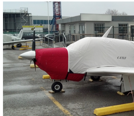
Mooney 201 Insulated Engine Cover, fully enclosed