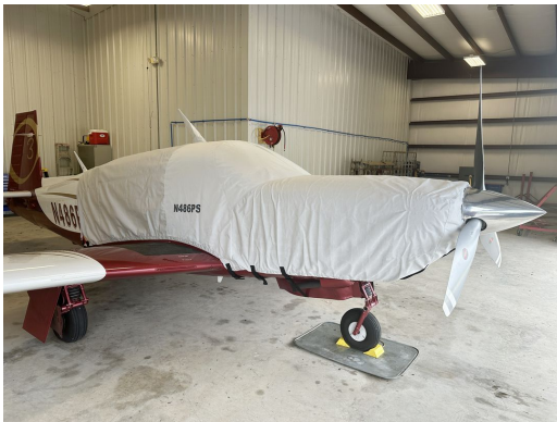
Mooney M20R Extended Canopy/Engine Cover

This cover type is made from Silver Acrylic Sunbrella canvas and is 100% lined with a soft and smooth microfiber. Bruce's Custom Covers developed this material combination especially for aircraft protection. The outer material is medium weight and treated for water resistance, UV resistance and anti-static buildup. The inner lining is a very soft and smooth microfiber to prevent scratching. The material is very reflective, and tests show that the cabin interior temperature can be reduced to near-ambient temperature on the hottest of days. It is water, ice and snow repellent, yet breathable to allow moisture to escape from between the cover and the aircraft surface.