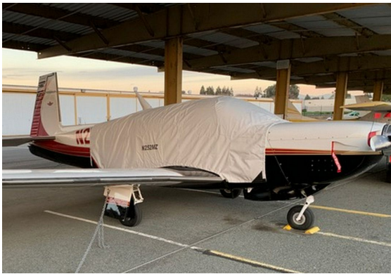
Mooney M20K Extended Canopy Cover

This cover type is made from Silver Acrylic Sunbrella canvas and is 100% lined with a soft and smooth microfiber. Bruce's Custom Covers developed this material combination especially for aircraft protection. The outer material is medium weight and treated for water resistance, UV resistance and anti-static buildup. The inner lining is a very soft and smooth microfiber to prevent scratching. The material is very reflective, and tests show that the cabin interior temperature can be reduced to near-ambient temperature on the hottest of days. It is water, ice and snow repellent, yet breathable to allow moisture to escape from between the cover and the aircraft surface.