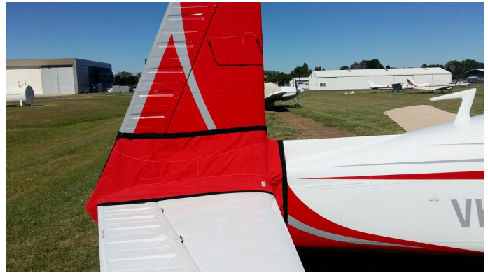
Mooney M20J Tailcone Cover