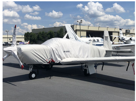
Mooney M20TN Acclaim Full Cover Set