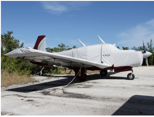
Mooney M20C Extended Canopy/Engine & Wing Covers