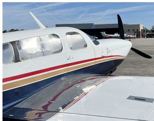
Mooney M20S Heatshield Set

Windshield Heatshields are interior sunshades for an aircraft's front windshield. The product is a unique composite of closed-cell foam with a silver mylar finish. The semi-rigid design is stiff enough to stand along the inside of the windshield using sun visors or window framing. It folds up flat and easily stores in the included storage sleeve. Some designs may require velcro and suction cups or split right and left sides. A Heatshield is an excellent short-term remedy for cockpit overheating. An external fabric cover is far more effective and practical for long-term protection.