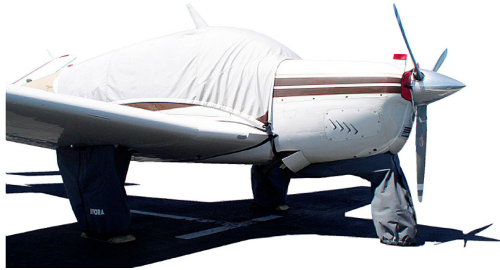
Beech Bonanza/Debonair/Baron Landing Gear Covers