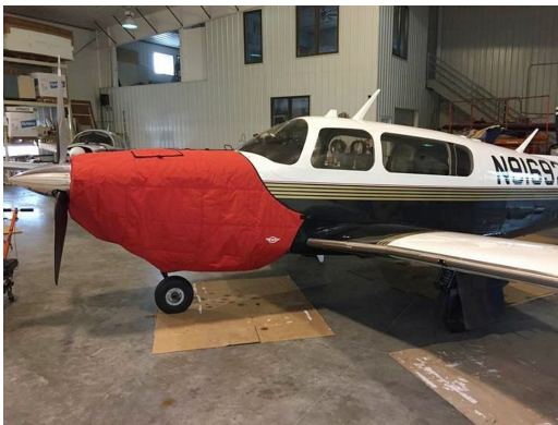
Mooney Ovation Insulated Engine Cover

This cover type is made from Silver Acrylic Sunbrella canvas and is 100% lined with a soft and smooth microfiber. Bruce's Custom Covers developed this material combination especially for aircraft protection. The outer material is medium weight and treated for water resistance, UV resistance and anti-static buildup. The inner lining is a very soft and smooth microfiber to prevent scratching. The material is very reflective, and tests show that the cabin interior temperature can be reduced to near-ambient temperature on the hottest of days. It is water, ice and snow repellent, yet breathable to allow moisture to escape from between the cover and the aircraft surface.