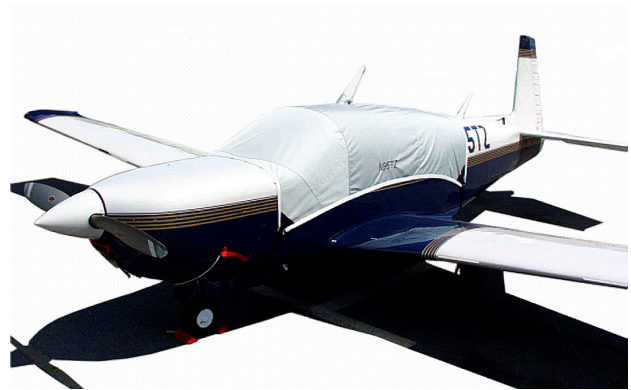
Porsche Mooney Canopy Cover & Plugs