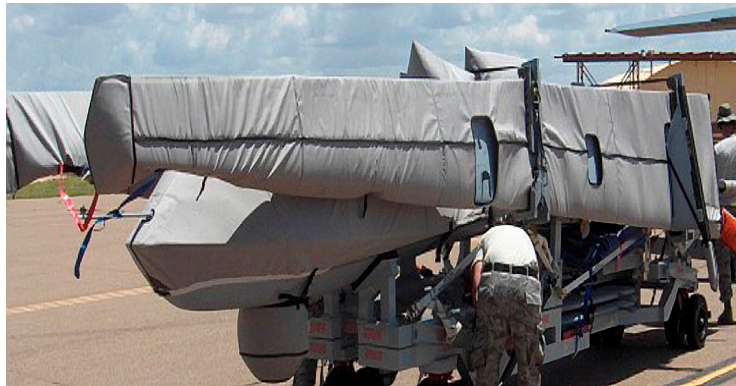
MQ1 Fuselage and Wing Covers

WINTER USE MATERIAL - Made with Solution-Dyed Polyester fabric, this option is intended for seasonal use to aid in deicing, rain mitigation, or for occasional travel. The material is lighter and more compact, but more susceptible to UV damage and may have a shorter useful life if used continuously outside than the all-year use material.