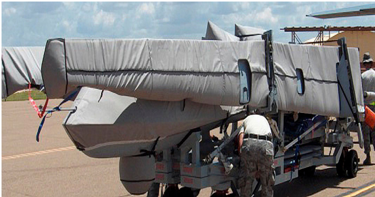
MQ1 Fuselage and Wing Covers