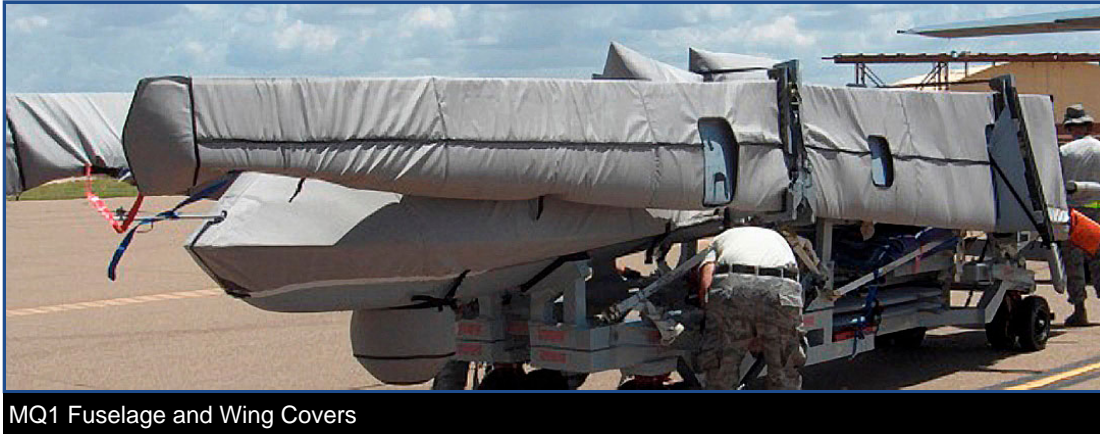
MQ1 Fuselage and Wing Covers