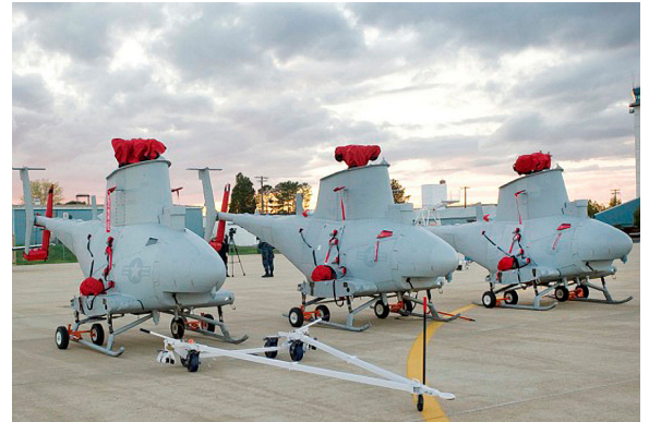
Northrop Grumman MQ-8 Firescout Plugs and Covers