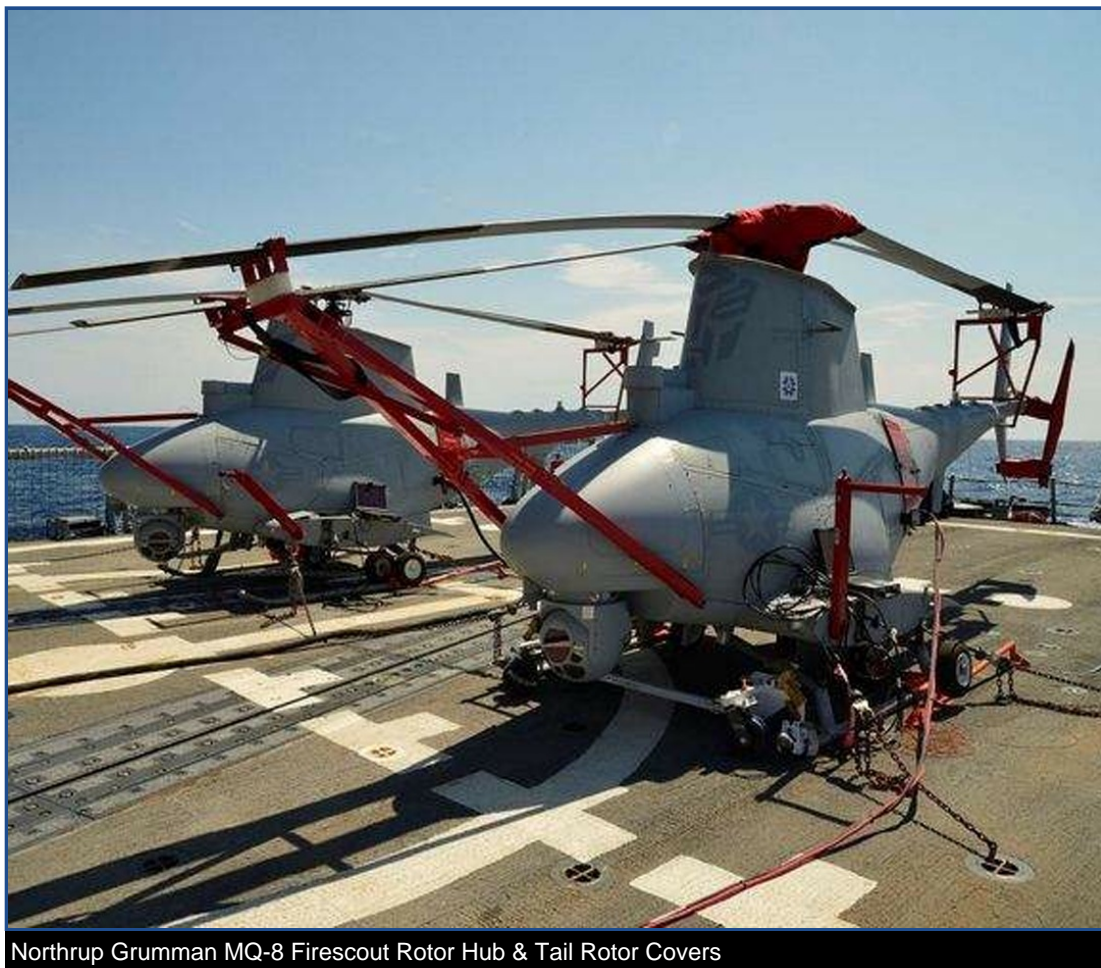
Northrop Grumman MQ-8 Fire Scout Rotor Hub &amp; Tail Rotor Covers