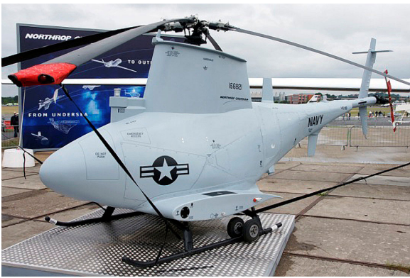
Northrup Grumman MQ-8 Firescout Blade Tie-Downs