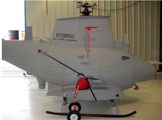
Covers & Plugs for the Northrop Grumman MQ-8 Fire Scout

WINTER USE MATERIAL - Made with Solution-Dyed Polyester fabric, this option is intended for seasonal use to aid in deicing, rain mitigation, or for occasional travel. The material is lighter and more compact, but more susceptible to UV damage and may have a shorter useful life if used continuously outside than the all-year use material.