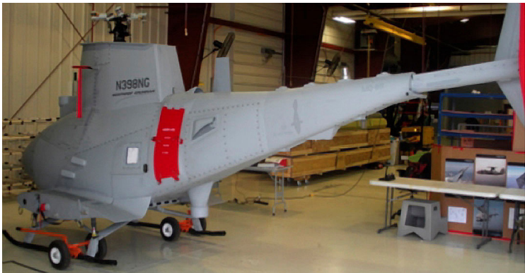
Covers & Plugs for the Northrop Grumman MQ-8 Fire Scout