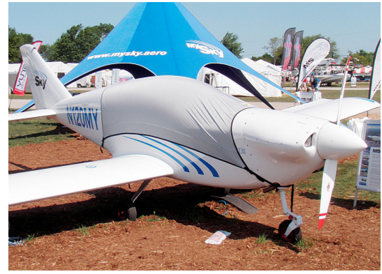
MySky Fly-Away Travel Cover