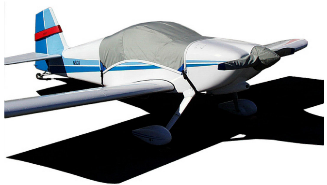
Canopy Cover, Prop Cover