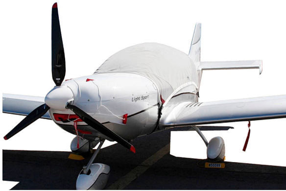
Sportcruiser Canopy Cover & Plugs

Travel Covers are made with Silver Solution-Dyed Polyester fabric and only lined over the windshield to save weight. The material is lightweight and more compact for easy stowage in the aircraft. The polyester material is water resistant, but only intended for occasional use outside. We also have an ultra lightweight material available for fitted hangar dust covers. For daily outdoor use, the non-travel Sunbrella Cover is the best choice.