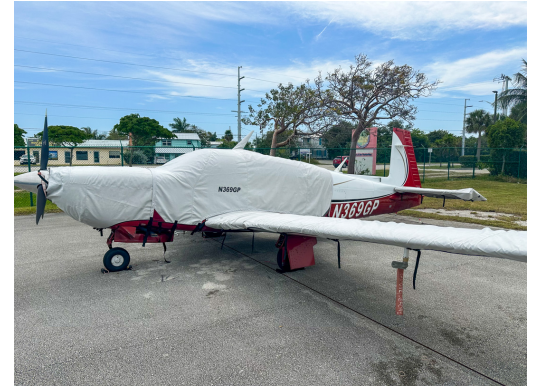
Mooney M20M Extended Canopy, Engine & Wing Covers