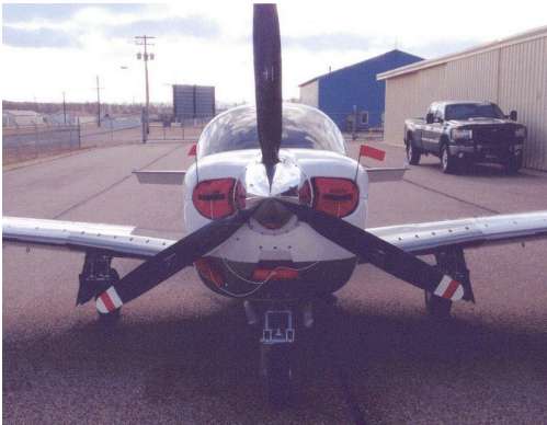
Mooney M20M TLS Engine Plugs

Engine Inlet Plugs are custom fit for your Mooney TLS, Bravo, Acclaim TN, Type S, & Porsche Powered Models intakes, made with heavy-duty vinyl material, and stuffed with a single block of sculpted urethane foam. Each plug has a zipper that allows the foam to be removed and dried if necessary. Engine plugs have warning flags that are visible from the cockpit or 'remove before flight' streamers sewn onto the face of the plugs. Most plugs are imprinted with the aircraft registration number in black for an extra charge. Storage bag NOT included. Engine plugs may be inserted after flight when the engine is still warm. Engine Inlet Plugs are commonly referred to as Cowl Plugs, Intake Plugs, Cowl Blocks, Engine Blocks, and Engine Bungs.