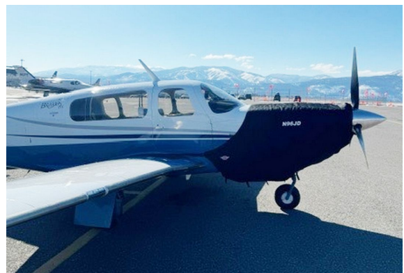
Mooney Bravo Insulated Engine Cover, Fully Enclosed