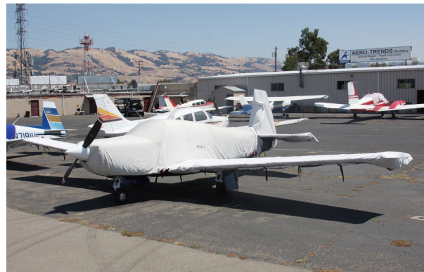
Mooney 231 Full Cover Set