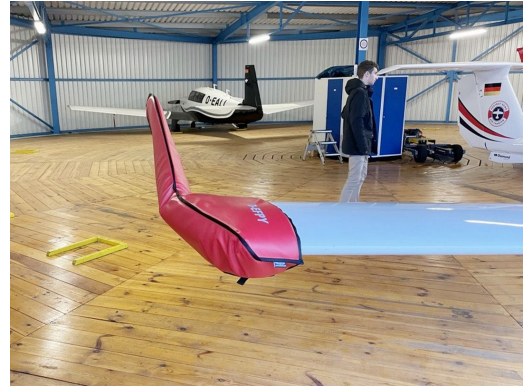
Diamond DA-40 Wingtip Pads