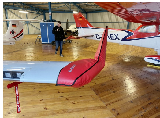
Diamond DA-40 Wingtip Pads