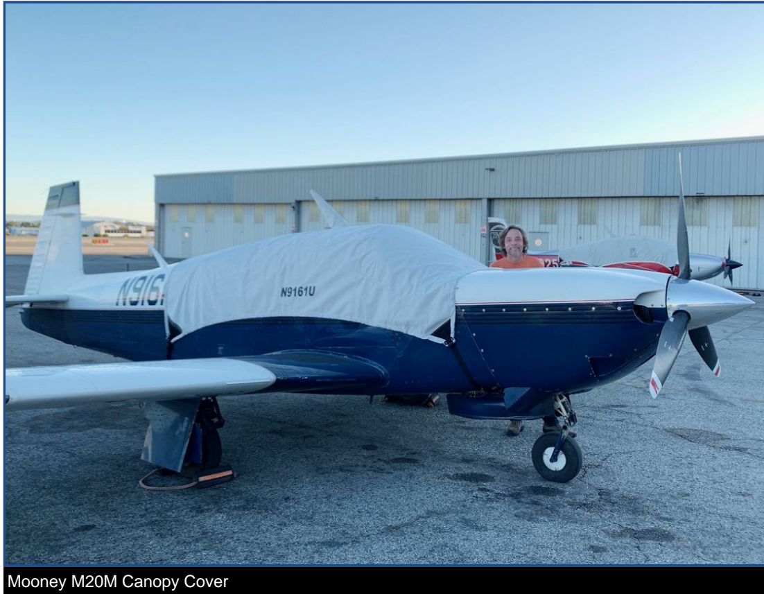
Mooney M20M Canopy Cover