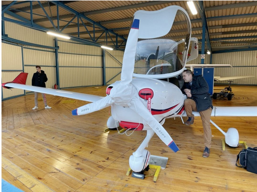
DA40 NG Engine Plugs

Designed to prevent damage to the aircraft extremities in crowded hangars, these products are made of bright red Naugahyde and thickly padded with a sandwich of closed cell foam.