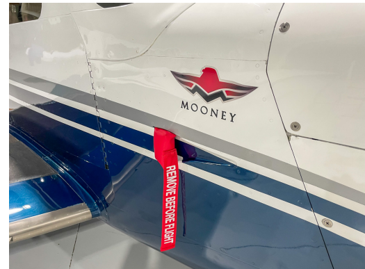
Mooney NACA Plug