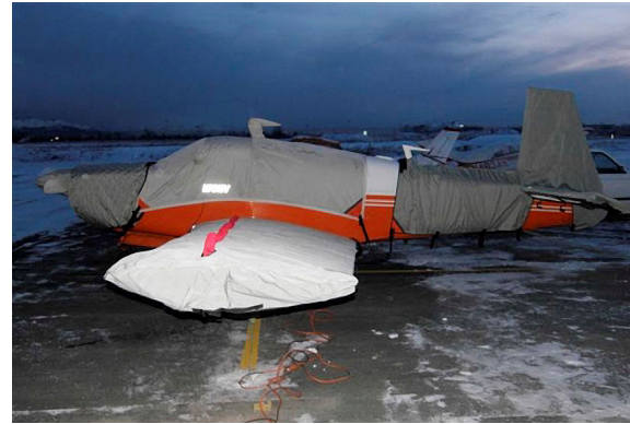
Mooney Prop/Spinner, Insulated Engine, Wing, Canopy and Empennage Covers