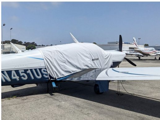
Mooney Ovation Extended Canopy Cover

This cover type is made from Silver Acrylic Sunbrella canvas and is 100% lined with a soft and smooth microfiber. Bruce's Custom Covers developed this material combination especially for aircraft protection. The outer material is medium weight and treated for water resistance, UV resistance and anti-static buildup. The inner lining is a very soft and smooth microfiber to prevent scratching. The material is very reflective, and tests show that the cabin interior temperature can be reduced to near-ambient temperature on the hottest of days. It is water, ice and snow repellent, yet breathable to allow moisture to escape from between the cover and the aircraft surface.