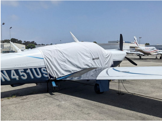
Mooney Ovation Extended Canopy Cover