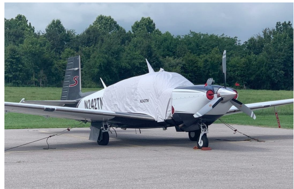
Mooney M20TN Extended Canopy Cover