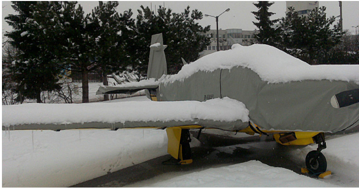
Mooney 231 Full Cover Set, doing its job in the Austrian Winter

WINTER USE MATERIAL - Made with Solution-Dyed Polyester fabric, this option is intended for seasonal use to aid in deicing, rain mitigation, or for occasional travel. The material is lighter and more compact, but more susceptible to UV damage and may have a shorter useful life if used continuously outside than the all-year use material.