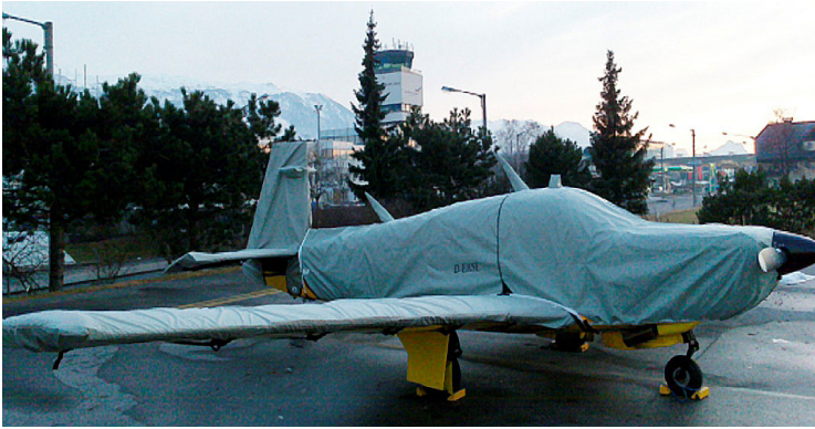
Mooney 231 Extra Extended Canopy/Engine Cover, Wing covers & Empennage Cover

WINTER USE MATERIAL - Made with Solution-Dyed Polyester fabric, this option is intended for seasonal use to aid in deicing, rain mitigation, or for occasional travel. The material is lighter and more compact, but more susceptible to UV damage and may have a shorter useful life if used continuously outside than the all-year use material.