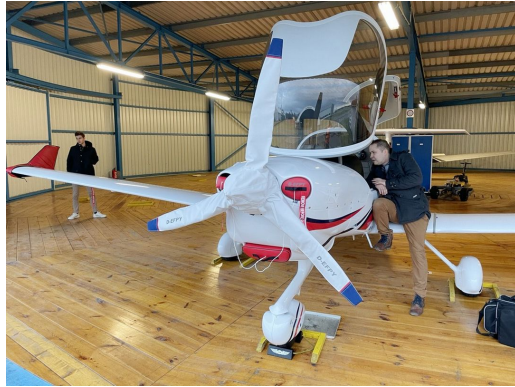
DA40 NG Engine Plugs

Designed to prevent damage to the aircraft extremities in crowded hangars, these products are made of bright red Naugahyde and thickly padded with a sandwich of closed cell foam.