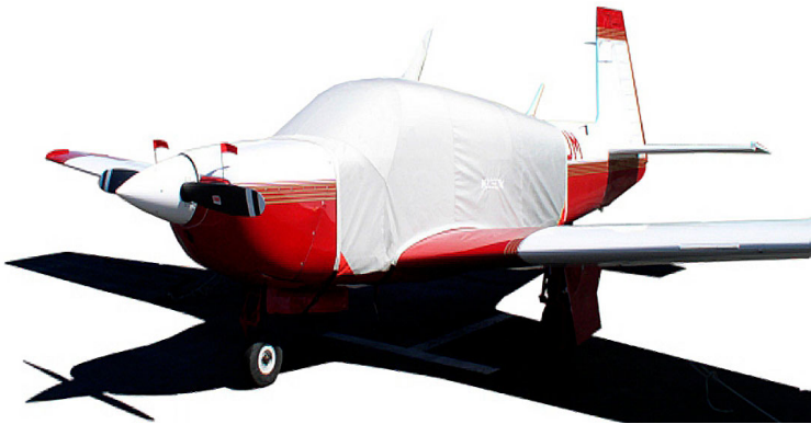
Mooney Extended Canopy Cover & Engine Plugs

This cover type is made from Silver Acrylic Sunbrella canvas and is 100% lined with a soft and smooth microfiber. Bruce's Custom Covers developed this material combination especially for aircraft protection. The outer material is medium weight and treated for water resistance, UV resistance and anti-static buildup. The inner lining is a very soft and smooth microfiber to prevent scratching. The material is very reflective, and tests show that the cabin interior temperature can be reduced to near-ambient temperature on the hottest of days. It is water, ice and snow repellent, yet breathable to allow moisture to escape from between the cover and the aircraft surface.