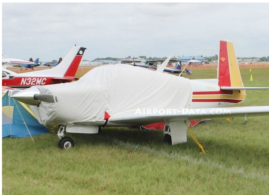
Mooney M20C Extended Canopy/Engine Cover

This cover type is made from Silver Acrylic Sunbrella canvas and is 100% lined with a soft and smooth microfiber. Bruce's Custom Covers developed this material combination especially for aircraft protection. The outer material is medium weight and treated for water resistance, UV resistance and anti-static buildup. The inner lining is a very soft and smooth microfiber to prevent scratching. The material is very reflective, and tests show that the cabin interior temperature can be reduced to near-ambient temperature on the hottest of days. It is water, ice and snow repellent, yet breathable to allow moisture to escape from between the cover and the aircraft surface.