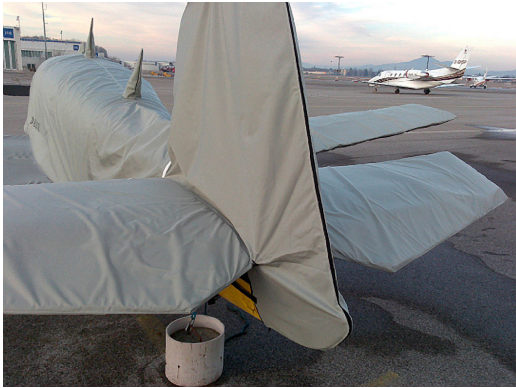
Mooney 231 Extra Extended Canopy/Engine Cover, Wing covers & Empennage Cover Mooney 231 Full Cover Set: Extra Extended Canopy/Engine Cover, Wing Covers, and Empennage Cover