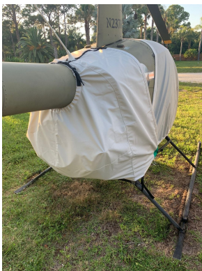
Robinson R-22 Engine Cover

Bruce's Autogyro MTO Sport, 2010, 2017 Gyrocopter Blade Covers are made of medium-weight Solution-Dyed Polyester and designed to avoid trim tabs or wicks. You can install Blade Covers from the ground with the aid of a lightweight rope attached to the open end. Covers are cinched tight at the blade root with straps and quick-release plastic buckles. The Cold Weather Blade Covers are fitted with full-length zippers and optional deice "boots" designed to accept a preheater hose; a small opening at the tip of the cover allows for some air circulation and drainage in freezing weather. Some part numbers have features for an extra charge.