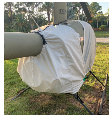
Robinson R-22 Engine Cover