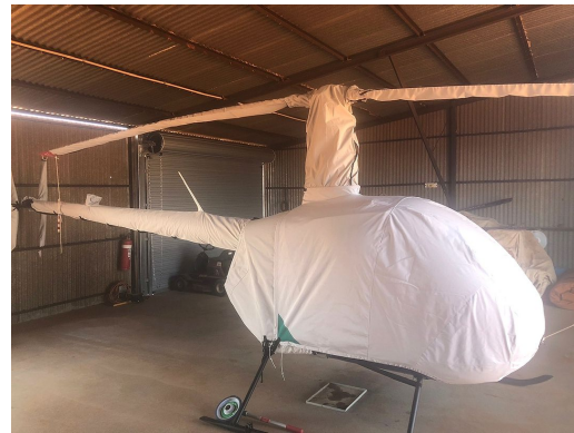
Robinson R-22 Full Cover Set