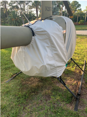
Robinson R-22 Engine Cover

Bruce's Autogyro MTO Sport, 2010, 2017 Gyrocopter Blade Covers are made of medium-weight Solution-Dyed Polyester and designed to avoid trim tabs or wicks. You can install Blade Covers from the ground with the aid of a lightweight rope attached to the open end. Covers are cinched tight at the blade root with straps and quick-release plastic buckles. The Cold Weather Blade Covers are fitted with full-length zippers and optional deice "boots" designed to accept a preheater hose; a small opening at the tip of the cover allows for some air circulation and drainage in freezing weather. Some part numbers have features for an extra charge.