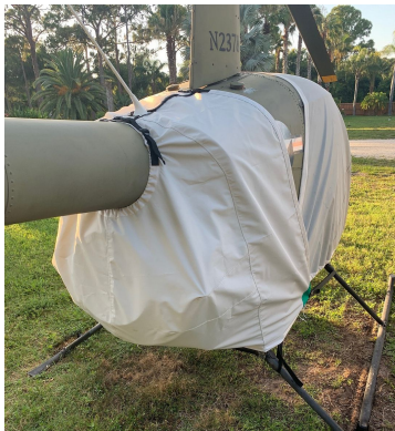
Robinson R-22 Engine Cover

Bruce's Autogyro MTO Sport, 2010, 2017 Gyrocopter Blade Covers are made of medium-weight Solution-Dyed Polyester and designed to avoid trim tabs or wicks. You can install Blade Covers from the ground with the aid of a lightweight rope attached to the open end. Covers are cinched tight at the blade root with straps and quick-release plastic buckles. The Cold Weather Blade Covers are fitted with full-length zippers and optional deice "boots" designed to accept a preheater hose; a small opening at the tip of the cover allows for some air circulation and drainage in freezing weather. Some part numbers have features for an extra charge.