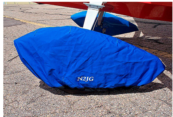
Bellanca Citabria Wheelpant Cover