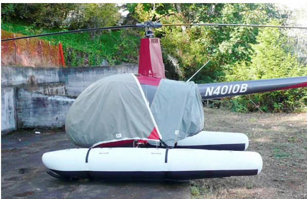
Robinson R-22 Standard Bubble Cover & Engine Cover

Bruce's Autogyro MTO Sport, 2010, 2017 Gyrocopter Blade Covers are made of medium-weight Solution-Dyed Polyester and designed to avoid trim tabs or wicks. You can install Blade Covers from the ground with the aid of a lightweight rope attached to the open end. Covers are cinched tight at the blade root with straps and quick-release plastic buckles. The Cold Weather Blade Covers are fitted with full-length zippers and optional deice "boots" designed to accept a preheater hose; a small opening at the tip of the cover allows for some air circulation and drainage in freezing weather. Some part numbers have features for an extra charge.