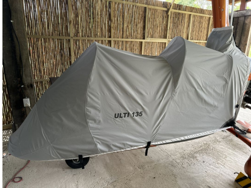
MTO Sport Travel Weight Canopy/Nose Cover

Travel Covers are made with Silver Solution-Dyed Polyester fabric and fully lined over the entire cover. The material is lightweight and more compact for easy storage in the aircraft. The polyester material is water resistant, but only intended for occasional use outside. We also have an ultra lightweight material available for fitted hangar dust covers. For daily outdoor use, the non-travel Sunbrella Cover is the best choice.