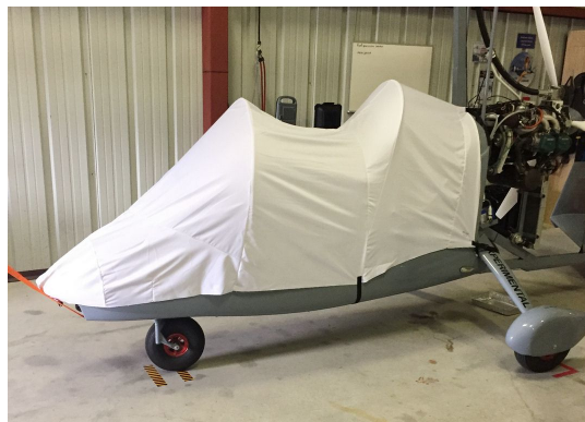
Magni M16 Autogyro Canopy/Nose Cover, test fit cover