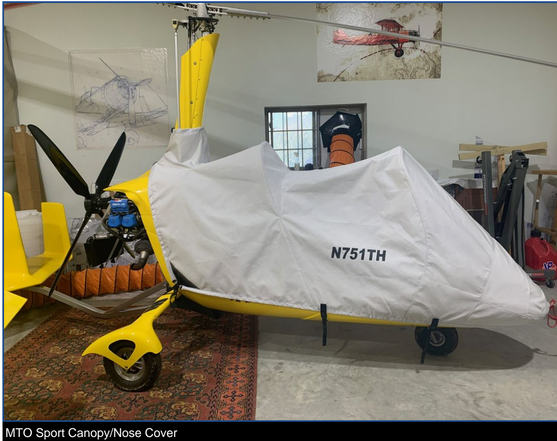
MTO Sport Canopy/Nose Cover