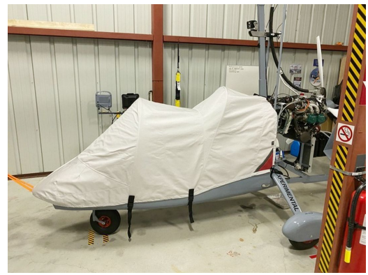
Magni Auto Gyro M16 Cockpit/Nose Cover