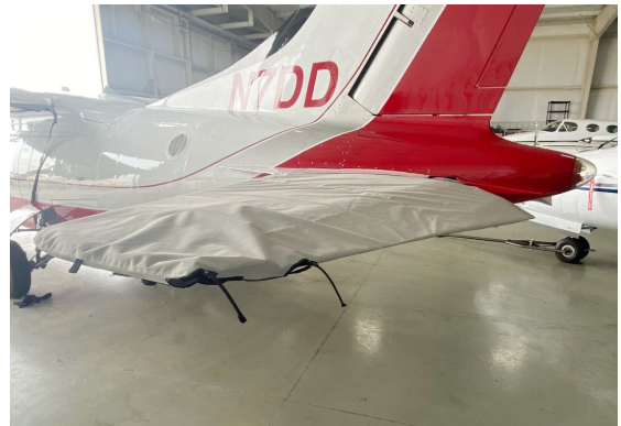
MU-2 Horizontal Stabilizer Covers