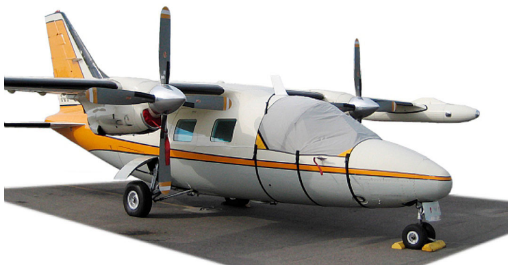
MU-2 Windshield Cover & Engine Plugs

Travel Covers are made with Silver Solution-Dyed Polyester fabric and only lined over the windshield to save weight. The material is lightweight and more compact for easy stowage in the aircraft. The polyester material is water resistant, but only intended for occasional use outside. We also have an ultra lightweight material available for fitted hangar dust covers. For daily outdoor use, the non-travel Sunbrella Cover is the best choice.