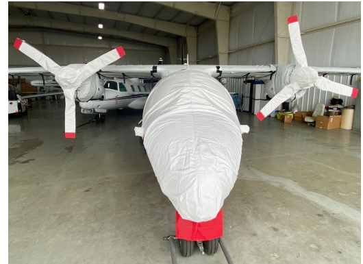
MU-2 Cockpit/Nose, Wing/Engine &amp; Prop Covers