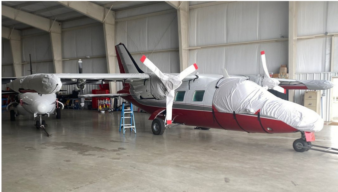
MU-2 Cockpit/Nose, Wing/Engine &amp; Prop Covers