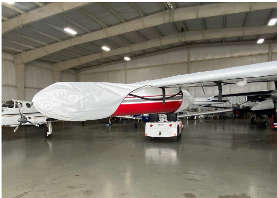
MU-2 Wing/Engine Covers

WINTER USE MATERIAL - Made with Solution-Dyed Polyester fabric, this option is intended for seasonal use to aid in deicing, rain mitigation, or for occasional travel. The material is lighter and more compact, but more susceptible to UV damage and may have a shorter useful life if used continuously outside than the all-year use material.