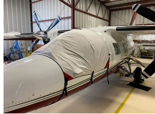
Mitsubishi MU-2 Cockpit Cover