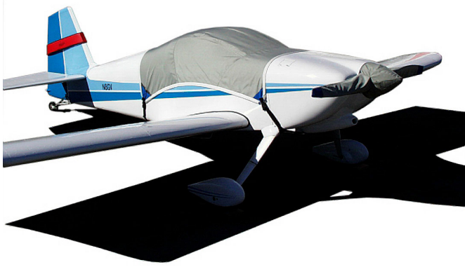
Canopy Cover, Prop Cover