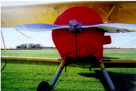
Stearman Engine Cover

This cover type is made from Silver Acrylic Sunbrella canvas and is 100% lined with a soft and smooth microfiber. Bruce's Custom Covers developed this material combination especially for aircraft protection. The outer material is medium weight and treated for water resistance, UV resistance and anti-static buildup. The inner lining is a very soft and smooth microfiber to prevent scratching. The material is very reflective, and tests show that the cabin interior temperature can be reduced to near-ambient temperature on the hottest of days. It is water, ice and snow repellent, yet breathable to allow moisture to escape from between the cover and the aircraft surface.