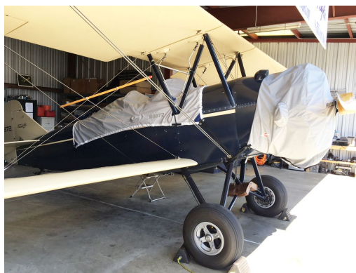
Boeing Stearman PT-13 Canopy, Wing & Horiz. Stab Covers Travel Air 4000 Canopy and Engine Covers, light weight travel type