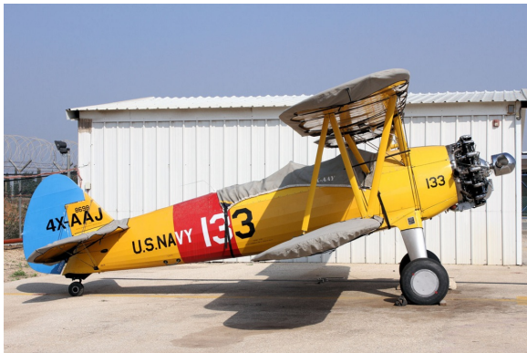
Boeing Stearman PT-13 Canopy, Wing & Horiz. Stab Covers

WINTER USE MATERIAL - Made with Solution-Dyed Polyester fabric, this option is intended for seasonal use to aid in deicing, rain mitigation, or for occasional travel. The material is lighter and more compact, but more susceptible to UV damage and may have a shorter useful life if used continuously outside than the all-year use material.