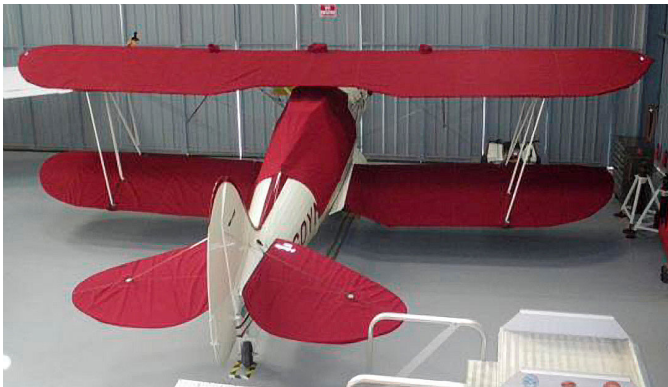
Waco UPF-7 Upper/Lower Wing Cover, Horizontal Stabilizer Cover, & Canopy Cover

WINTER USE MATERIAL - Made with Solution-Dyed Polyester fabric, this option is intended for seasonal use to aid in deicing, rain mitigation, or for occasional travel. The material is lighter and more compact, but more susceptible to UV damage and may have a shorter useful life if used continuously outside than the all-year use material.