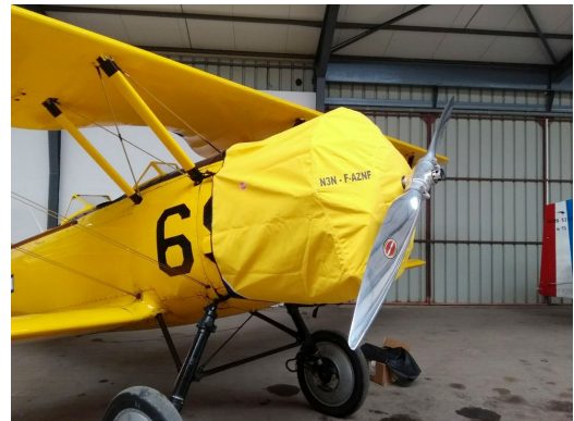
N3N Engine Cover