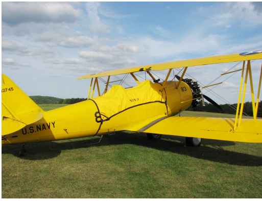
N3N Canopy Cover