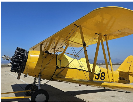
Naval Aircraft Factory N3N-3 Canopy Cover