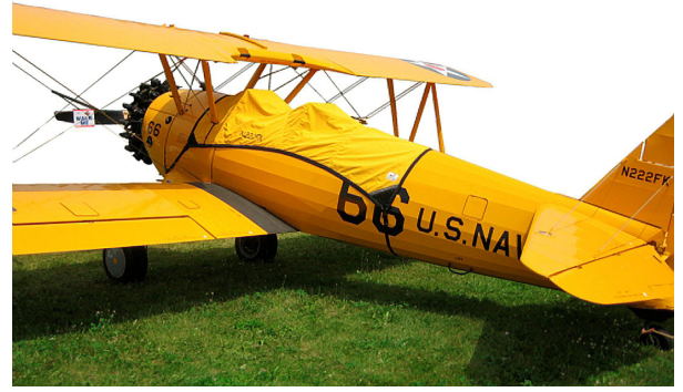
Stearman Canopy Cover