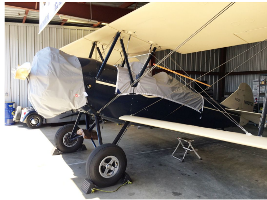
Boeing Stearman PT-13 Canopy, Wing & Horiz. Stab Covers Travel Air 4000 Canopy and Engine Covers, light weight travel type