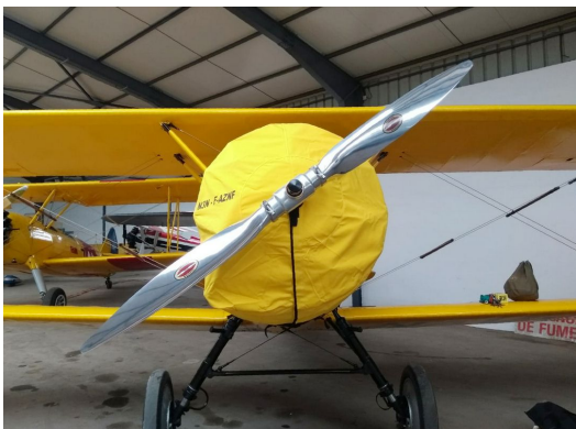
N3N Engine Cover

This cover type is made from Silver Acrylic Sunbrella canvas and is 100% lined with a soft and smooth microfiber. Bruce's Custom Covers developed this material combination especially for aircraft protection. The outer material is medium weight and treated for water resistance, UV resistance and anti-static buildup. The inner lining is a very soft and smooth microfiber to prevent scratching. The material is very reflective, and tests show that the cabin interior temperature can be reduced to near-ambient temperature on the hottest of days. It is water, ice and snow repellent, yet breathable to allow moisture to escape from between the cover and the aircraft surface.