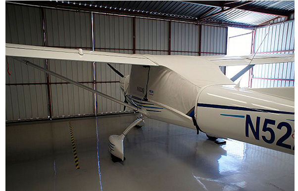
TL Ultralight Sirius Canopy Cover