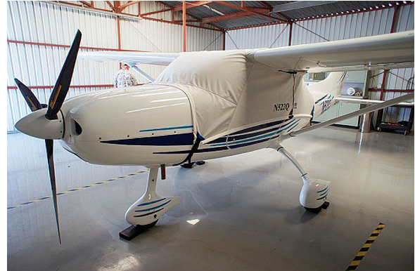
TL Ultralight Sirius Canopy Cover