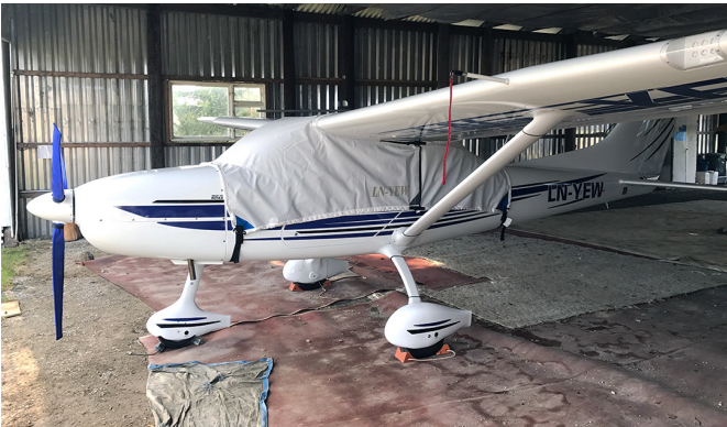
TL Ultralight Sirius TL-3000 Canopy Cover (Over-The-Top Style) TL Ultralight Sirius TL-3000 Canopy Cover (Over-The-Top Style)