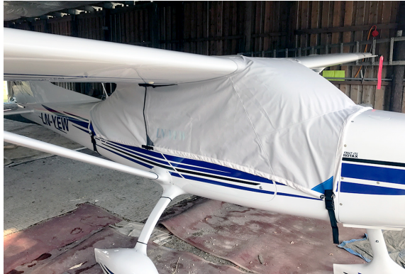
TL Ultralight Sirius TL-3000 Canopy Cover (Over-The-Top Style)

This cover type is made from Silver Acrylic Sunbrella canvas and is 100% lined with a soft and smooth microfiber. Bruce's Custom Covers developed this material combination especially for aircraft protection. The outer material is medium weight and treated for water resistance, UV resistance and anti-static buildup. The inner lining is a very soft and smooth microfiber to prevent scratching. The material is very reflective, and tests show that the cabin interior temperature can be reduced to near-ambient temperature on the hottest of days. It is water, ice and snow repellent, yet breathable to allow moisture to escape from between the cover and the aircraft surface.