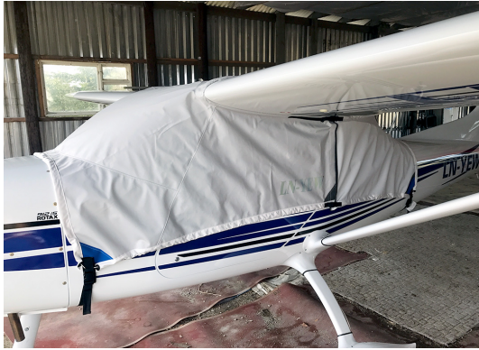
TL Ultralight Sirius TL-3000 Canopy Cover (Over-The-Top Style)

This cover type is made from Silver Acrylic Sunbrella canvas and is 100% lined with a soft and smooth microfiber. Bruce's Custom Covers developed this material combination especially for aircraft protection. The outer material is medium weight and treated for water resistance, UV resistance and anti-static buildup. The inner lining is a very soft and smooth microfiber to prevent scratching. The material is very reflective, and tests show that the cabin interior temperature can be reduced to near-ambient temperature on the hottest of days. It is water, ice and snow repellent, yet breathable to allow moisture to escape from between the cover and the aircraft surface.