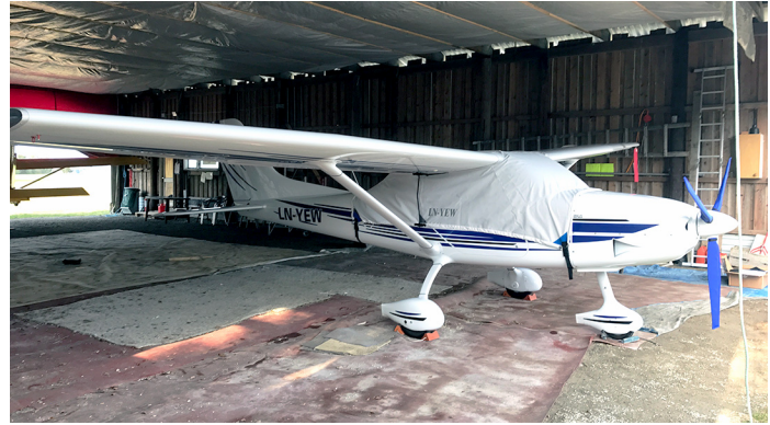
TL Ultralight Sirius TL-3000 Canopy Cover (Over-The-Top Style)