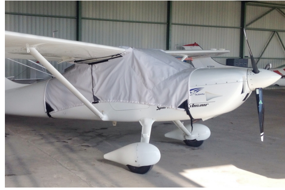
Glasair Aviation Glastar, Sportsman 2+2 Canopy Cover (Over-The-Top Style)