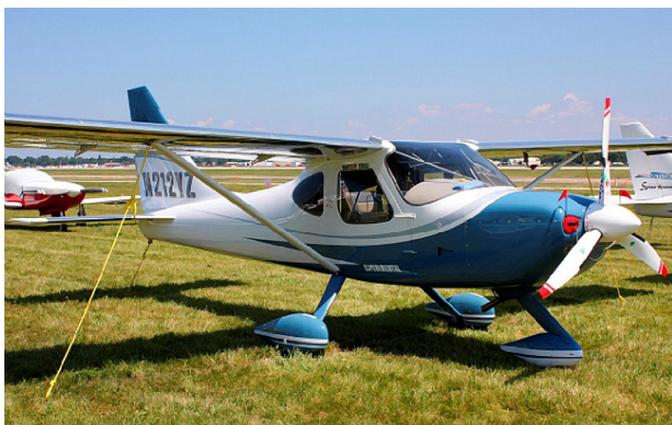
Glastar Sportsman Engine Inlet Plugs

Engine Inlet Plugs are custom fit for your OMF Symphony 160 intakes, made with heavy-duty vinyl material, and stuffed with a single block of sculpted urethane foam. Each plug has a zipper that allows the foam to be removed and dried if necessary. Engine plugs have warning flags that are visible from the cockpit or 'remove before flight' streamers sewn onto the face of the plugs. Most plugs are imprinted with the aircraft registration number in black for an extra charge. Storage bag NOT included. Engine plugs may be inserted after flight when the engine is still warm. Engine Inlet Plugs are commonly referred to as Cowl Plugs, Intake Plugs, Cowl Blocks, Engine Blocks, and Engine Bungs.