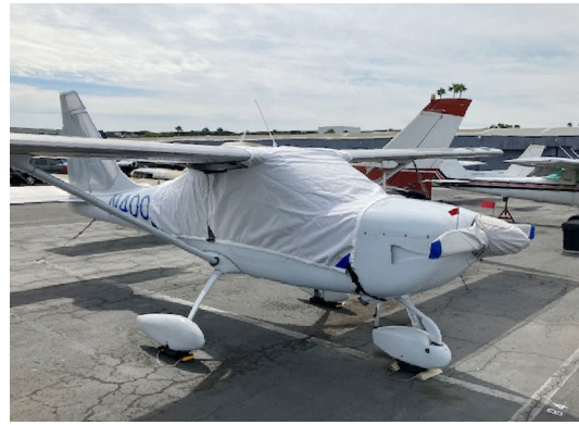
OMF Symphony 160 Canopy Cover, Over Top Type