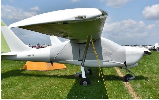
Glastar Travel Cover

This cover type is made from Silver Acrylic Sunbrella canvas and is 100% lined with a soft and smooth microfiber. Bruce's Custom Covers developed this material combination especially for aircraft protection. The outer material is medium weight and treated for water resistance, UV resistance and anti-static buildup. The inner lining is a very soft and smooth microfiber to prevent scratching. The material is very reflective, and tests show that the cabin interior temperature can be reduced to near-ambient temperature on the hottest of days. It is water, ice and snow repellent, yet breathable to allow moisture to escape from between the cover and the aircraft surface.