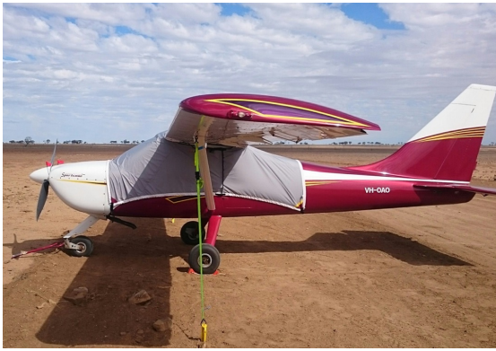
Glstar Sportsman Light Weight Travel Cover