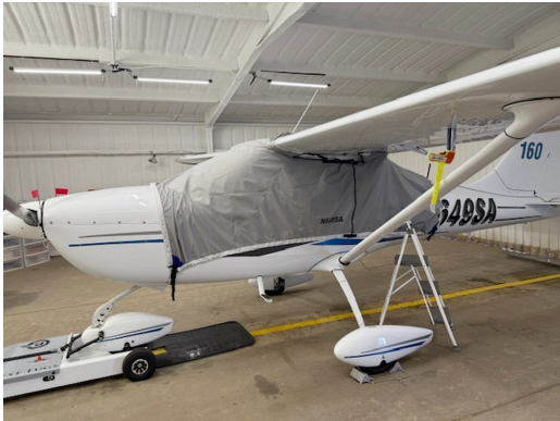
OMF Symphony Travel Cover, Light Weight Canopy Cover (Over-The-Top Style)