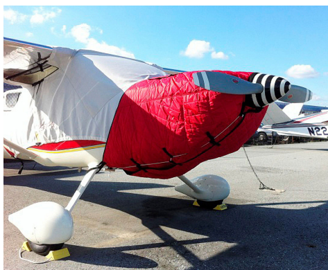
Glastar Insulated Engine Cover