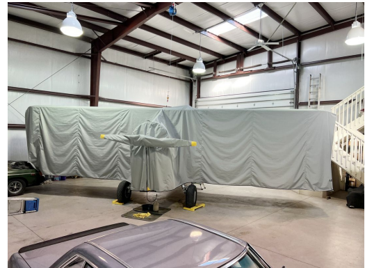
Stearman PT-13 Full Body Dust Cover