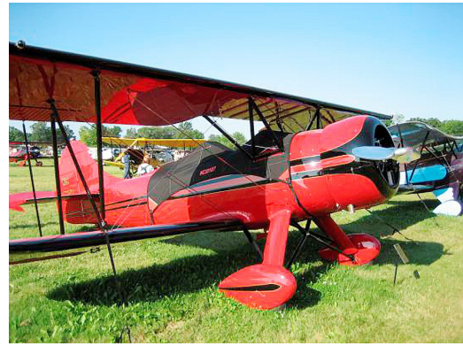
Waco UPF7 Canopy Cover