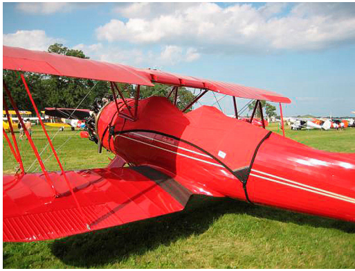
Waco UPF7 Canopy Cover