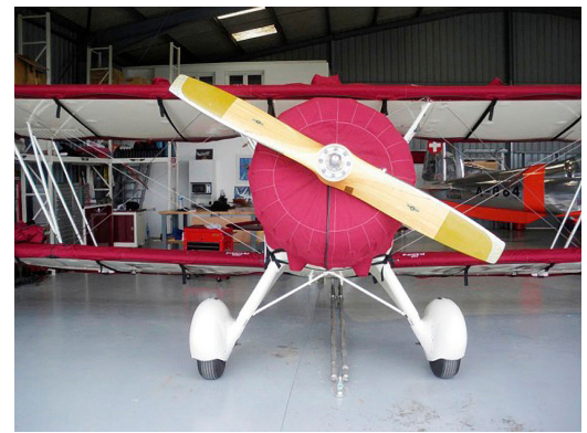
Waco UPF-7 Engine Cover