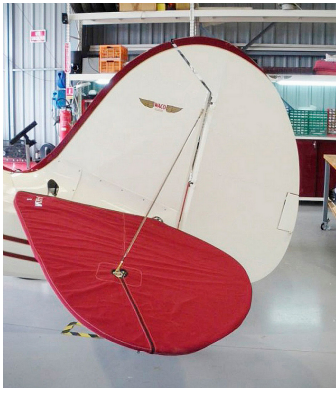
Waco UPF-7 Horizontal Stab. Cover