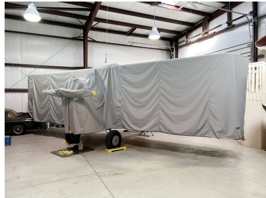
Stearman PT-13 Full Body Dust Cover, Prop Cover Included