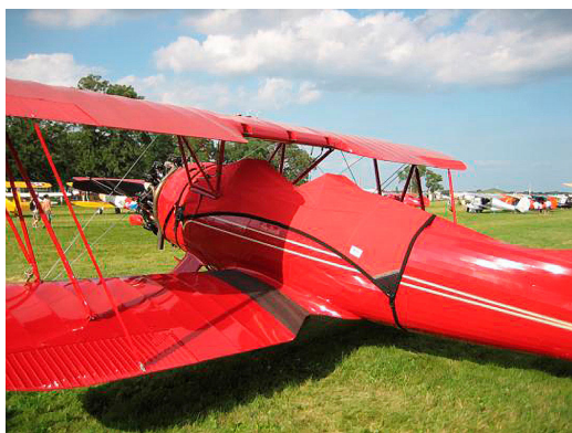
Waco UPF7 Canopy Cover