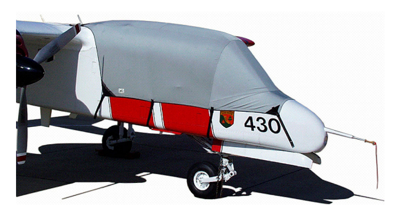
Rockwell OV-10 Canopy Cover