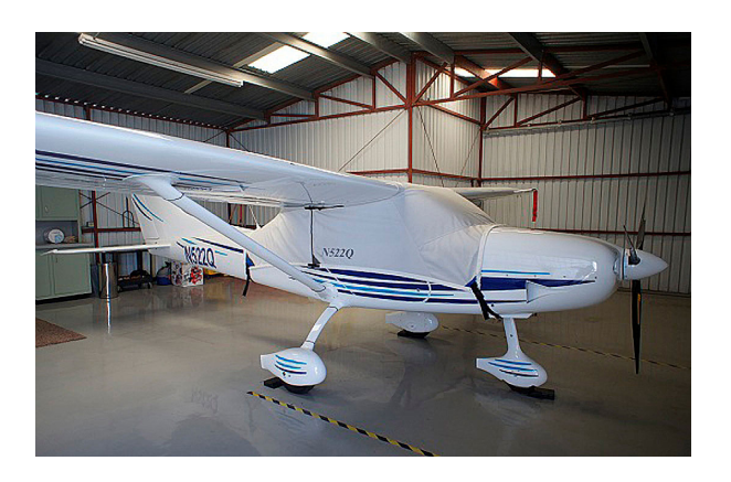
TL Ultralight Sirius Canopy Cover