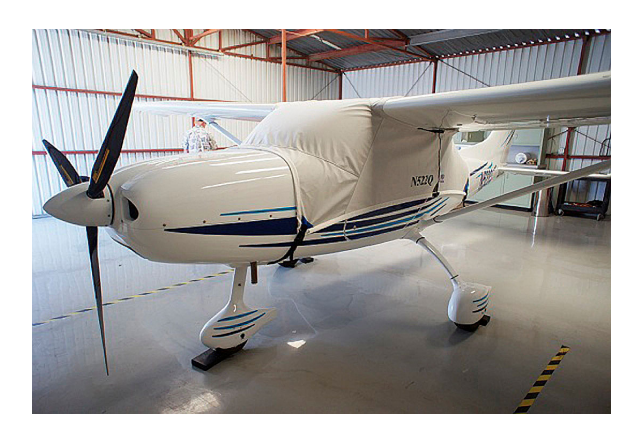
TL Ultralight Sirius Canopy Cover

the hottest of days. It is water, ice and snow repellent, yet breathable to allow moisture to escape from between the cover and the aircraft surface.