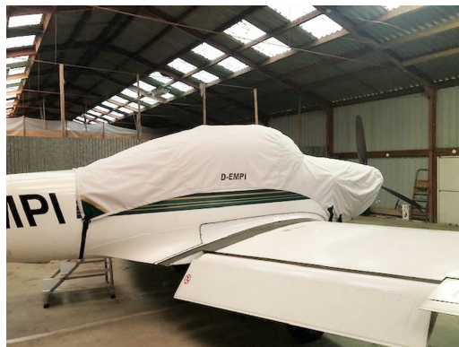
Piaggio FW-149D Canopy/Engine Cover