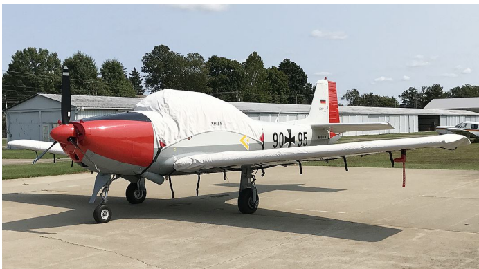
Focke Wulf F149 Canopy Cover, Wing Covers, Engine Plugs

WINTER USE MATERIAL - Made with Solution-Dyed Polyester fabric, this option is intended for seasonal use to aid in deicing, rain mitigation, or for occasional travel. The material is lighter and more compact, but more susceptible to UV damage and may have a shorter useful life if used continuously outside than the all-year use material.