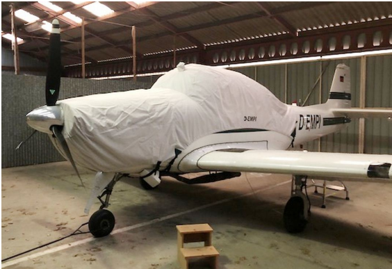
Piaggio FW-149D Canopy/Engine Cover

Cover and Engine Cover. This cover will enclose the engine cowl and will extend aft to cover all of the windows. This cover type is made from Silver Acrylic Sunbrella canvas and is 100% lined with a soft and smooth microfiber. Bruce's Custom Covers developed this material combination especially for aircraft protection. The outer material is medium weight and treated for water resistance, UV resistance and anti-static buildup. The inner lining is a very soft and smooth microfiber to prevent scratching. The material is very reflective, and tests show that the cabin interior temperature can be reduced to near-ambient temperature on the hottest of days. It is water, ice and snow repellent, yet breathable to allow moisture to escape from between the cover and the aircraft surface.