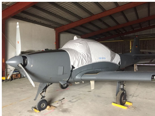
Piaggio P149D Canopy Cover

Cover and Engine Cover. This cover will enclose the engine cowl and will extend aft to cover all of the windows. This cover type is made from Silver Acrylic Sunbrella canvas and is 100% lined with a soft and smooth microfiber. Bruce's Custom Covers developed this material combination especially for aircraft protection. The outer material is medium weight and treated for water resistance, UV resistance and anti-static buildup. The inner lining is a very soft and smooth microfiber to prevent scratching. The material is very reflective, and tests show that the cabin interior temperature can be reduced to near-ambient temperature on the hottest of days. It is water, ice and snow repellent, yet breathable to allow moisture to escape from between the cover and the aircraft surface.