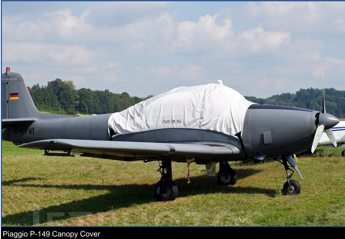
Piaggio P-149 Canopy Cover