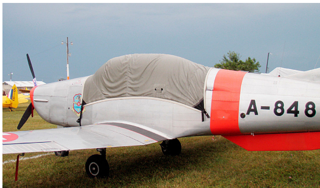
Piaggio P-149D Trainer Canopy Cover

Cover and Engine Cover. This cover will enclose the engine cowl and will extend aft to cover all of the windows. This cover type is made from Silver Acrylic Sunbrella canvas and is 100% lined with a soft and smooth microfiber. Bruce's Custom Covers developed this material combination especially for aircraft protection. The outer material is medium weight and treated for water resistance, UV resistance and anti-static buildup. The inner lining is a very soft and smooth microfiber to prevent scratching. The material is very reflective, and tests show that the cabin interior temperature can be reduced to near-ambient temperature on the hottest of days. It is water, ice and snow repellent, yet breathable to allow moisture to escape from between the cover and the aircraft surface.