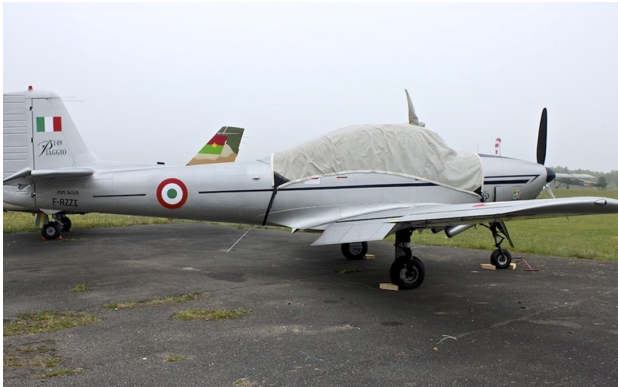
Piaggio P-149 Canopy Cover

Cover and Engine Cover. This cover will enclose the engine cowl and will extend aft to cover all of the windows. This cover type is made from Silver Acrylic Sunbrella canvas and is 100% lined with a soft and smooth microfiber. Bruce's Custom Covers developed this material combination especially for aircraft protection. The outer material is medium weight and treated for water resistance, UV resistance and anti-static buildup. The inner lining is a very soft and smooth microfiber to prevent scratching. The material is very reflective, and tests show that the cabin interior temperature can be reduced to near-ambient temperature on the hottest of days. It is water, ice and snow repellent, yet breathable to allow moisture to escape from between the cover and the aircraft surface.