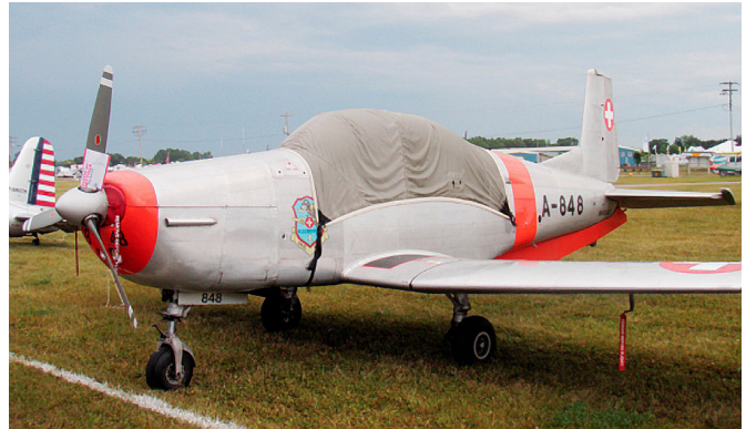
Piaggio P-149D Trainer Canopy Cover