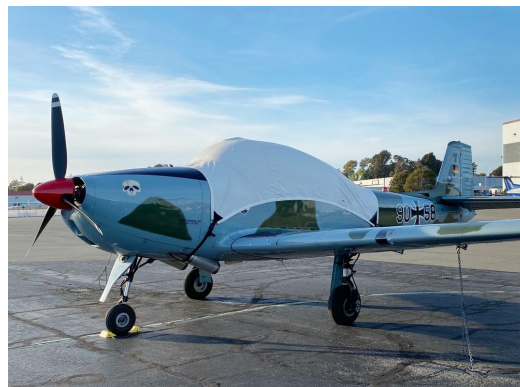
Focke Wulf 149 Trainer Canopy Cover