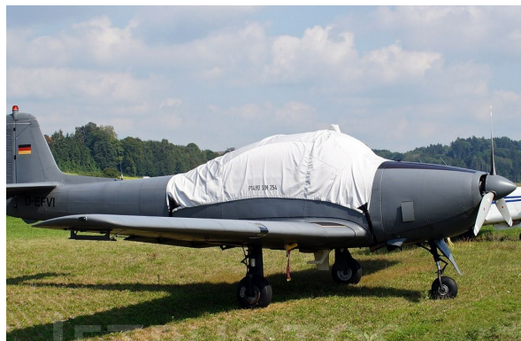
Piaggio P-149 Canopy Cover