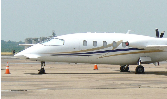
Piaggio Avanti P180 Cockpit Heatshields

Cockpit Heatshields are interior sunshades for the aircraft's cockpit. The product is a unique composite of closed-cell foam with a silver mylar finish. The semi-rigid design is stiff enough to stand inside the window framing. The set folds up flat and is easily stored in the included storage sleeve. Some designs may require velcro and suction cups. A Heatshield is an excellent short-term remedy for cockpit overheating, but an external fabric cover is more effective for long-term protection.