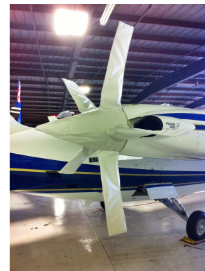
Piaggio 180 5-Blade Prop/Hub Cover