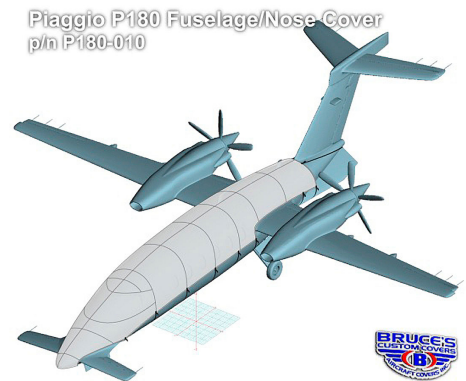
Piaggio 180 Fuselage/Nose Cover