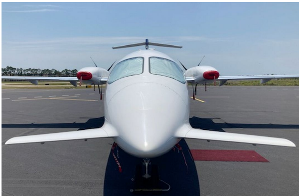
Piaggio P180 Cockpit HeatShields,

Engine Inlet Plugs are custom fit for your Piaggio Avanti P180 intakes, made with heavy-duty vinyl material, and stuffed with a single block of sculpted urethane foam. Each plug has a zipper that allows the foam to be removed and dried if necessary. Engine plugs have warning flags that are visible from the cockpit or 'remove before flight' streamers sewn onto the face of the plugs. Most plugs are imprinted with the aircraft registration number in black for an extra charge. Storage bag NOT included. Engine plugs may be inserted after flight when the engine is still warm. Engine Inlet Plugs are commonly referred to as Cowl Plugs, Intake Plugs, Cowl Blocks, Engine Blocks, and Engine Bungs.