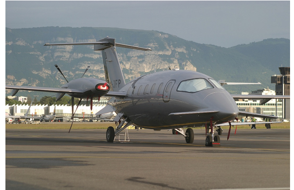
Piaggio 180 Cockpit HeatShields