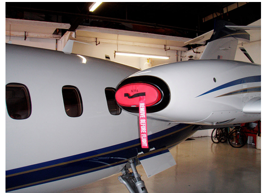
Piaggio 180 Engine Inlet Plugs