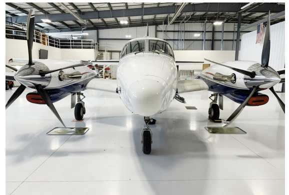
Piper Cheyenne Engine Inlet Plugs