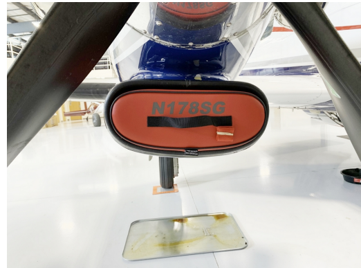
Piper Cheyenne Engine Inlet Plugs