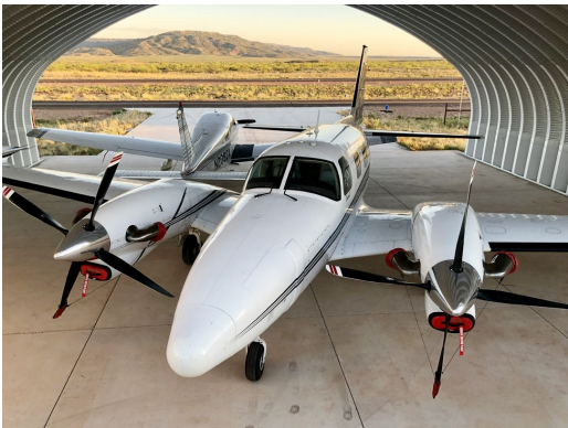
Piper PA-31T Cheyenne II Prop Tie-Downs/Exhaust Covers Piper PA-31T Cheyenne Intake Plugs, Prop Tie/Exhaust Covers