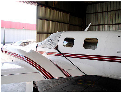
Piper Cheyenne Cockpit Cover

This cover type is made from Silver Acrylic Sunbrella canvas and is 100% lined with a soft and smooth microfiber. Bruce's Custom Covers developed this material combination especially for aircraft protection. The outer material is medium weight and treated for water resistance, UV resistance and anti-static buildup. The inner lining is a very soft and smooth microfiber to prevent scratching. The material is very reflective, and tests show that the cabin interior temperature can be reduced to near-ambient temperature on the hottest of days. It is water, ice and snow repellent, yet breathable to allow moisture to escape from between the cover and the aircraft surface.