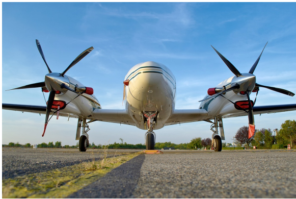
Piper Cheyenne Intake Plugs, Exhaust Covers, Prop Ties

This cover type is made from Silver Acrylic Sunbrella canvas and is 100% lined with a soft and smooth microfiber. Bruce's Custom Covers developed this material combination especially for aircraft protection. The outer material is medium weight and treated for water resistance, UV resistance and anti-static buildup. The inner lining is a very soft and smooth microfiber to prevent scratching. The material is very reflective, and tests show that the cabin interior temperature can be reduced to near-ambient temperature on the hottest of days. It is water, ice and snow repellent, yet breathable to allow moisture to escape from between the cover and the aircraft surface.