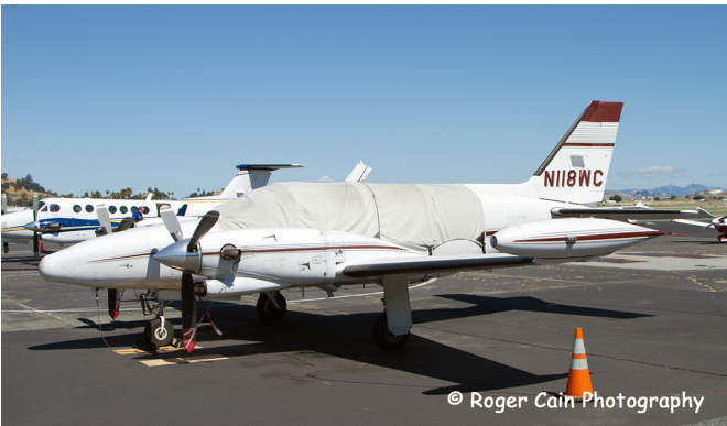
Piper PA-31T Cheyenne Canopy Cover