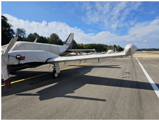
Piper PA-31T Cheyenne Canopy, Wing & Engine Covers

This cover type is made from Silver Acrylic Sunbrella canvas and is 100% lined with a soft and smooth microfiber. Bruce's Custom Covers developed this material combination especially for aircraft protection. The outer material is medium weight and treated for water resistance, UV resistance and anti-static buildup. The inner lining is a very soft and smooth microfiber to prevent scratching. The material is very reflective, and tests show that the cabin interior temperature can be reduced to near-ambient temperature on the hottest of days. It is water, ice and snow repellent, yet breathable to allow moisture to escape from between the cover and the aircraft surface.