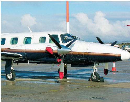
Piper Cheyenne IIXL Prop Tie/Exhaust Covers, Intake Plugs

Engine Inlet Plugs are custom fit for your Piper PA-31T: Cheyenne, Cheyenne II XL intakes, made with heavy-duty vinyl material, and stuffed with a single block of sculpted urethane foam. Each plug has a zipper that allows the foam to be removed and dried if necessary. Engine plugs have warning flags that are visible from the cockpit or 'remove before flight' streamers sewn onto the face of the plugs. Most plugs are imprinted with the aircraft registration number in black for an extra charge. Storage bag NOT included. Engine plugs may be inserted after flight when the engine is still warm. Engine Inlet Plugs are commonly referred to as Cowl Plugs, Intake Plugs, Cowl Blocks, Engine Blocks, and Engine Bungs.