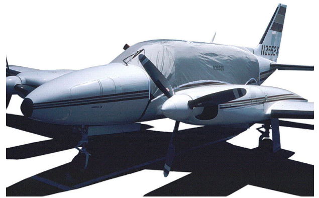
Piper Navajo Canopy Cover