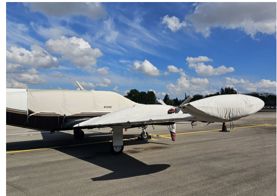
Piper PA-31T Cheyenne Canopy, Wing & Engine Covers