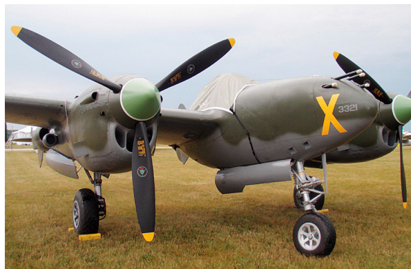
P38 Lightning Canopy Cover (snap-on type)