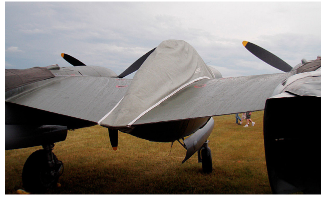
P38 Lightning Canopy Cover (snap-on type)