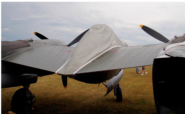
P38 Lightning Canopy Cover (snap-on type)