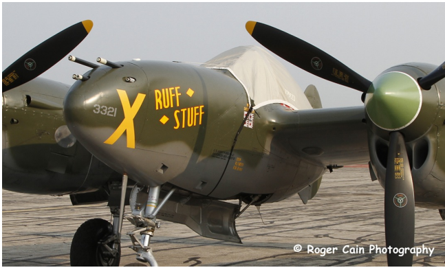
P38 Lightning Canopy Cover (snap-on type)