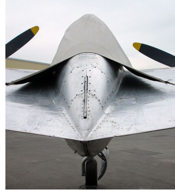
Lockheed P38 Lightning Canopy Cover