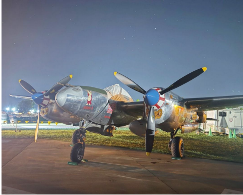
Lockheed P38 Lightning Canopy Cover

The material is very reflective, and tests show that the cabin interior temperature can be reduced to near-ambient temperature on the hottest of days. It is water, ice and snow repellent, yet breathable to allow moisture to escape from between the cover and the aircraft surface.