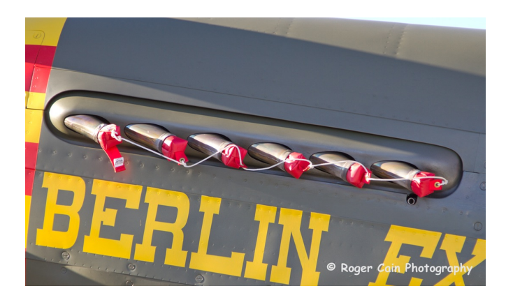
North American P-51 Exhaust Plugs

Engine Inlet Plugs are custom fit for your Curtiss P40 Warhawk intakes, made with heavy-duty vinyl material, and stuffed with a single block of sculpted urethane foam. Each plug has a zipper that allows the foam to be removed and dried if necessary. Engine plugs have warning flags that are visible from the cockpit or 'remove before flight' streamers sewn onto the face of the plugs. Most plugs are imprinted with the aircraft registration number in black for an extra charge. Storage bag NOT included. Engine plugs may be inserted after flight when the engine is still warm. Engine Inlet Plugs are commonly referred to as Cowl Plugs, Intake Plugs, Cowl Blocks, Engine Blocks, and Engine Bungs.