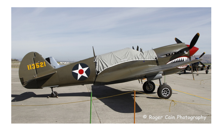
P40 Canopy Cover