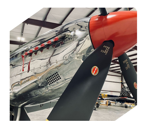
North American TF-51D Exhaust Plugs