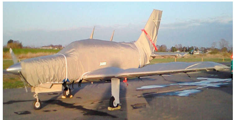
Piper PA-46 Malibu Complete Cover Set