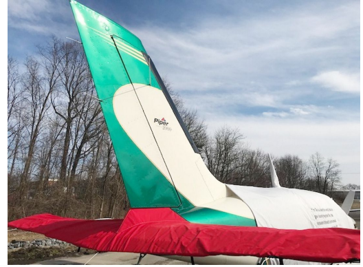
Piper Malibu/Mirage Horizontal Stabilizer/Tailcone Cover