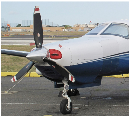
Piper Mirage Engine Plugs

Engine Inlet Plugs are custom fit for your Piper PA-46-350P Mirage, Matrix, JetProp intakes, made with heavy-duty vinyl material, and stuffed with a single block of sculpted urethane foam. Each plug has a zipper that allows the foam to be removed and dried if necessary. Engine plugs have warning flags that are visible from the cockpit or 'remove before flight' streamers sewn onto the face of the plugs. Most plugs are imprinted with the aircraft registration number in black for an extra charge. Storage bag NOT included. Engine plugs may be inserted after flight when the engine is still warm. Engine Inlet Plugs are commonly referred to as Cowl Plugs, Intake Plugs, Cowl Blocks, Engine Blocks, and Engine Bungs.