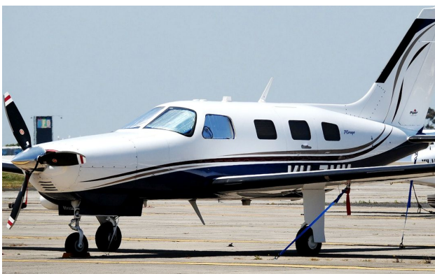
Piper PA-46-350P Mirage, Matrix, JetProp Cockpit Heatshields