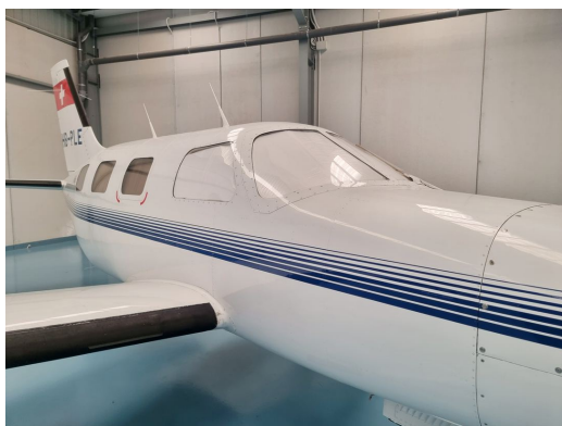
Piper PA-46 Malibu Cockpit Heatshields