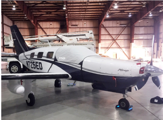
Piper Malibu/Mirage Cockpit Cover, Engine Plugs

Travel Covers are made with Silver Solution-Dyed Polyester fabric and only lined over the windshield to save weight. The material is lightweight and more compact for easy stowage in the aircraft. The polyester material is water resistant, but only intended for occasional use outside. We also have an ultra lightweight material available for fitted hangar dust covers. For daily outdoor use, the non-travel Sunbrella Cover is the best choice.