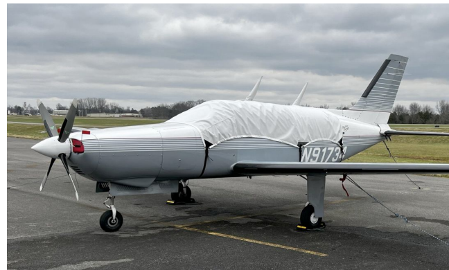
Piper PA46-350P Canopy Cover