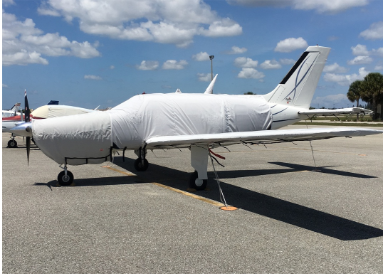
Piper Malibu Extended Canopy Cover, Engine, Wing & Horiz. Stab. Covers

WINTER USE MATERIAL - Made with Solution-Dyed Polyester fabric, this option is intended for seasonal use to aid in deicing, rain mitigation, or for occasional travel. The material is lighter and more compact, but more susceptible to UV damage and may have a shorter useful life if used continuously outside than the all-year use material.