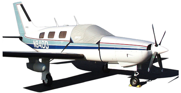
Piper Malibu/Mirage Windshield Cover