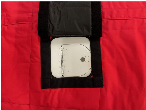
Malibu PA-46-310P Insulated Engine Cover, Oil Door Access

This cover type is made from Silver Acrylic Sunbrella canvas and is 100% lined with a soft and smooth microfiber. Bruce's Custom Covers developed this material combination especially for aircraft protection. The outer material is medium weight and treated for water resistance, UV resistance and anti-static buildup. The inner lining is a very soft and smooth microfiber to prevent scratching. The material is very reflective, and tests show that the cabin interior temperature can be reduced to near-ambient temperature on the hottest of days. It is water, ice and snow repellent, yet breathable to allow moisture to escape from between the cover and the aircraft surface.