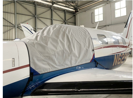
Piper PA-46-500TP Travel Cover Cockpit Cover