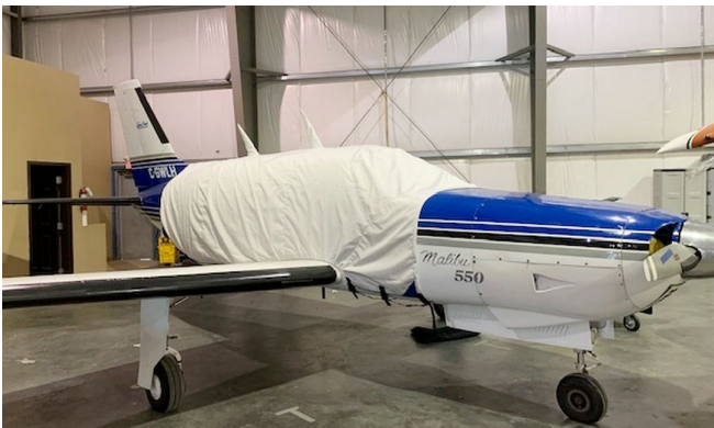
Piper Malibu/Mirage Extended Canopy Cover

This cover type is made from Silver Acrylic Sunbrella canvas and is 100% lined with a soft and smooth microfiber. Bruce's Custom Covers developed this material combination especially for aircraft protection. The outer material is medium weight and treated for water resistance, UV resistance and anti-static buildup. The inner lining is a very soft and smooth microfiber to prevent scratching. The material is very reflective, and tests show that the cabin interior temperature can be reduced to near-ambient temperature on the hottest of days. It is water, ice and snow repellent, yet breathable to allow moisture to escape from between the cover and the aircraft surface.