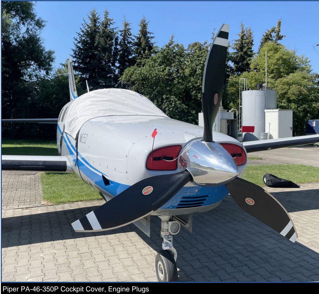
Piper PA-46-350P Cockpit Cover, Engine Plugs