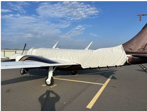
Piper PA-601 Aerostar Fuselage Cover (back to Horiz Stab)

The Piper PA-601 Aerostar Nose Cover is designed to cover the section of the fuselage forward of the windshield to the tip of the nose. It is secured with belly strapsThis cover type is made from Silver Acrylic Sunbrella canvas and is 100% lined with a soft and smooth microfiber. Bruce's Custom Covers developed this material combination especially for aircraft protection. The outer material is medium weight and treated for water resistance, UV resistance and anti-static buildup. The inner lining is a very soft and smooth microfiber to prevent scratching. The material is very reflective, and tests show that the cabin interior temperature can be reduced to near-ambient temperature on the hottest of days. It is water, ice and snow repellent, yet breathable to allow moisture to escape from between the cover and the aircraft surface.