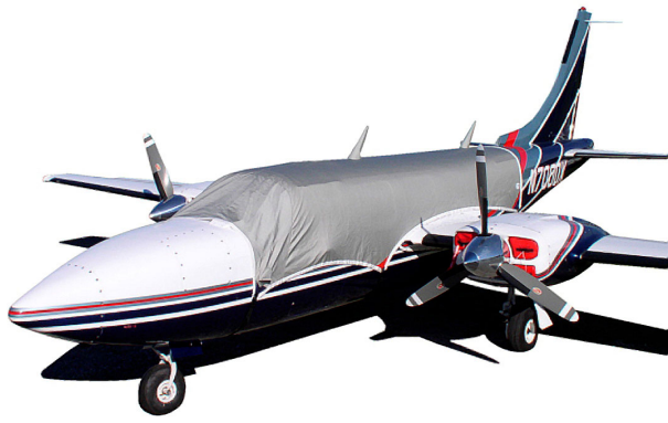
Aerostar Canopy Cover & Plugs