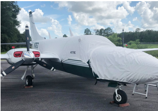
Piper Aerostar Canopy & Nose Covers, Engine Plugs