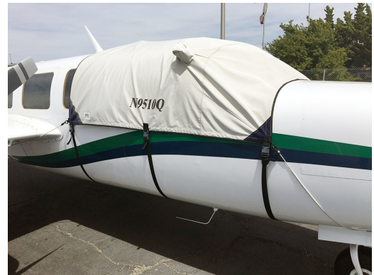
Piper PA-601 Aerostar Cockpit Cover