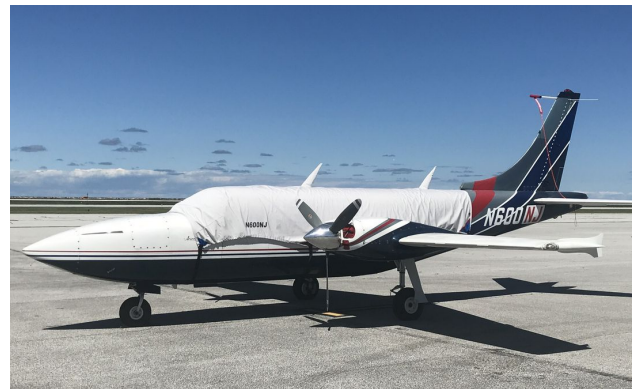
Smith Aerostar 600 Canopy Cover