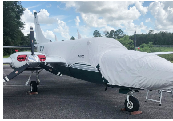
Piper Aerostar Canopy & Nose Covers, Engine Plugs