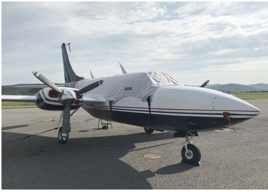
Smith Aerostar 600 Canopy Cover