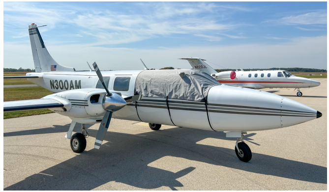
AEROSTAR 601P Travel Cover, Light Weight Travel Cockpit/Skylights Cover