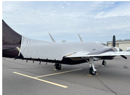
Piper PA-601 Aerostar Fuselage Cover (back to Horiz Stab)