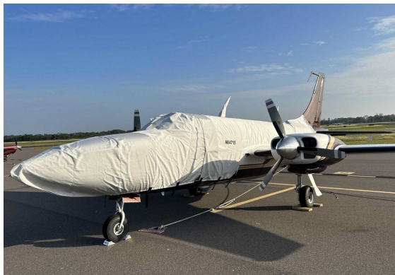
Piper PA-601 Aerostar Fuselage Cover (back to Horiz Stab)

The Piper PA-601 Aerostar Nose Cover is designed to cover the section of the fuselage forward of the windshield to the tip of the nose. It is secured with belly straps. This cover type is made from Silver Acrylic Sunbrella canvas and is 100% lined with a soft and smooth microfiber. Bruce's Custom Covers developed this material combination especially for aircraft protection. The outer material is medium weight and treated for water resistance, UV resistance and anti-static buildup. The inner lining is a very soft and smooth microfiber to prevent scratching. The material is very reflective, and tests show that the cabin interior temperature can be reduced to near-ambient temperature on the hottest of days. It is water, ice and snow repellent, yet breathable to allow moisture to escape from between the cover and the aircraft surface.