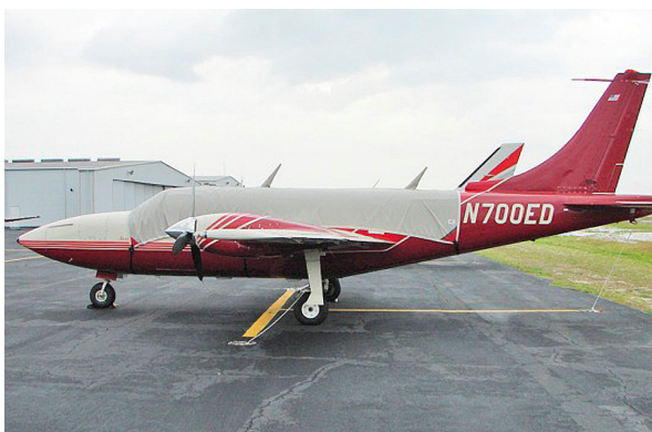
Piper Aerostar Canopy Cover, extended over baggage door

Travel Covers are made with Silver Solution-Dyed Polyester fabric and only lined over the windshield to save weight. The material is lightweight and more compact for easy stowage in the aircraft. The polyester material is water resistant, but only intended for occasional use outside. We also have an ultra lightweight material available for fitted hangar dust covers. For daily outdoor use, the non-travel Sunbrella Cover is the best choice.