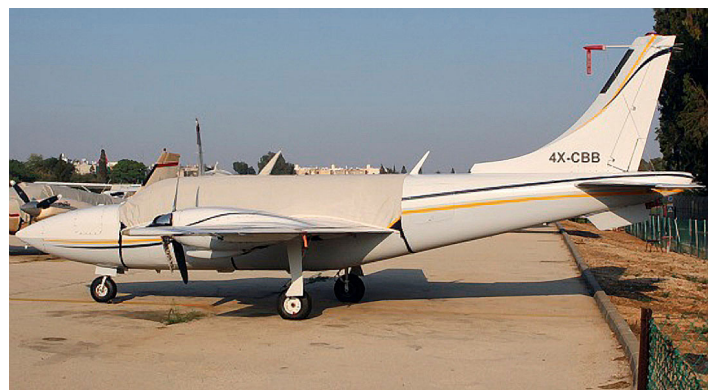
Piper Aerostar Canopy Cover