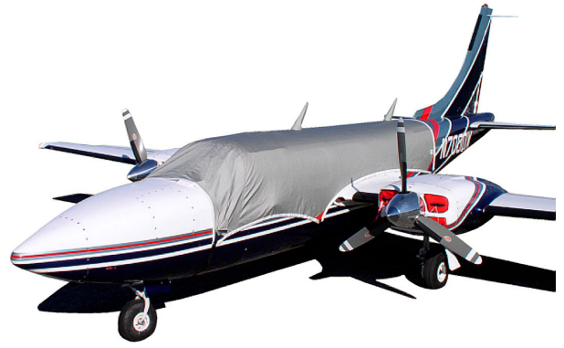
Aerostar Canopy Cover & Plugs