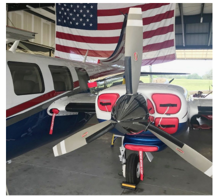
Piper Aerostar Engine Plugs