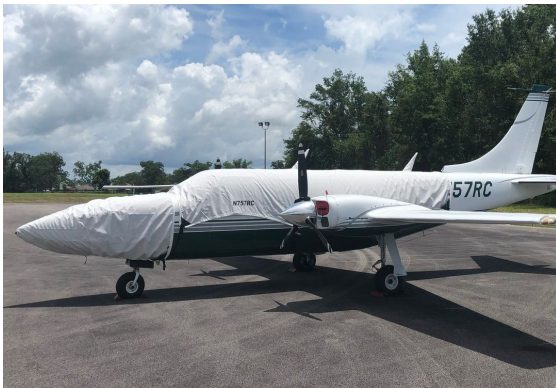
Piper Aerostar Canopy & Nose Covers, Engine Plugs

The Piper PA-601 Aerostar Nose Cover is designed to cover the section of the fuselage forward of the windshield to the tip of the nose. It is secured with belly straps. This cover type is made from Silver Acrylic Sunbrella canvas and is 100% lined with a soft and smooth microfiber. Bruce's Custom Covers developed this material combination especially for aircraft protection. The outer material is medium weight and treated for water resistance, UV resistance and anti-static buildup. The inner lining is a very soft and smooth microfiber to prevent scratching. The material is very reflective, and tests show that the cabin interior temperature can be reduced to near-ambient temperature on the hottest of days. It is water, ice and snow repellent, yet breathable to allow moisture to escape from between the cover and the aircraft surface.