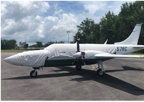
Piper Aerostar Canopy & Nose Covers, Engine Plugs