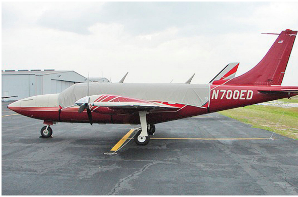
Piper Aerostar Canopy Cover, extended over baggage door