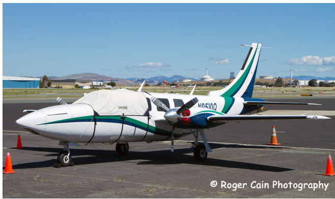
Piper Aerostar Cockpit Cover and Engine Inlet Plugs