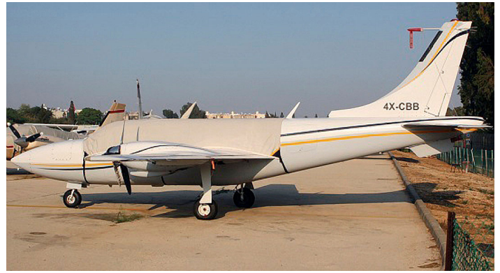
Piper Aerostar Canopy Cover