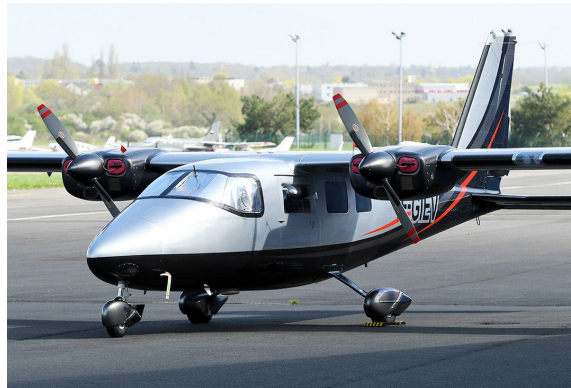
Partenavia P68c Cockpit HeatShields, Engine Plugs

Heatshields are interior sunshades for an aircraft's windows or canopy glass. The product is a unique composite of closed-cell foam with a silver mylar finish. The semi-rigid design is stiff enough to stand along the inside of the windshield using sun visors or window framing. It folds up flat and easily stores in the included storage sleeve. Some designs may require velcro and suction cups. A Heatshield is an excellent short-term remedy for cockpit overheating.