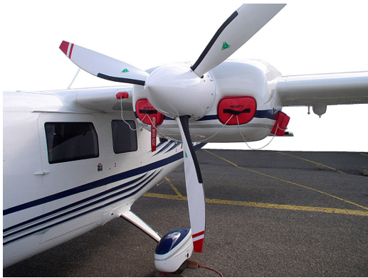
Observer Engine Plugs

Engine Inlet Plugs are custom fit for your Partenavia, Vulcanair P-68C & P-68R intakes, made with heavy-duty vinyl material, and stuffed with a single block of sculpted urethane foam. Each plug has a zipper that allows the foam to be removed and dried if necessary. Engine plugs have warning flags that are visible from the cockpit or 'remove before flight' streamers sewn onto the face of the plugs. Most plugs are imprinted with the aircraft registration number in black for an extra charge. Storage bag NOT included. Engine plugs may be inserted after flight when the engine is still warm. Engine Inlet Plugs are commonly referred to as Cowl Plugs, Intake Plugs, Cowl Blocks, Engine Blocks, and Engine Bungs.