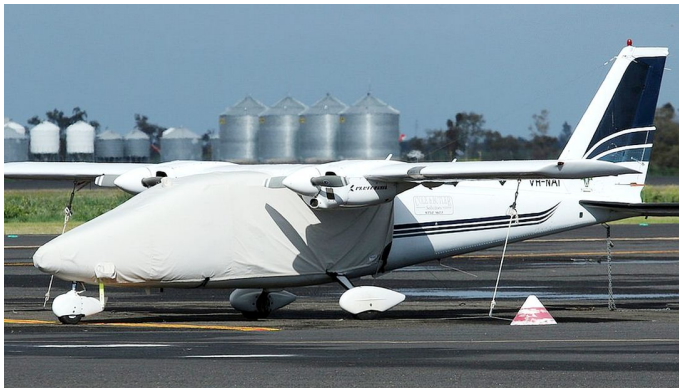
Partenavia P-68C Canopy Cover

The material is very reflective, and tests show that the cabin interior temperature can be reduced to near-ambient temperature on the hottest of days. It is water, ice and snow repellent, yet breathable to allow moisture to escape from between the cover and the aircraft surface.