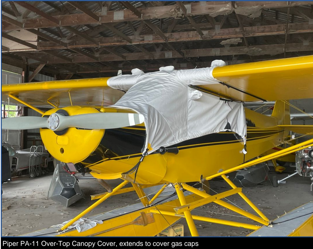
Piper PA-11 Over-Top Canopy Cover, extends to cover gas caps