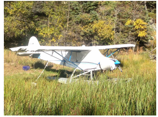
Piper PA-11 Cover Set