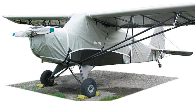
Piper PA-11 Replica Insulated Engine Cover Prop Cover, Engine Cover, Canopy Cover, Wing Covers and Empennage Cover