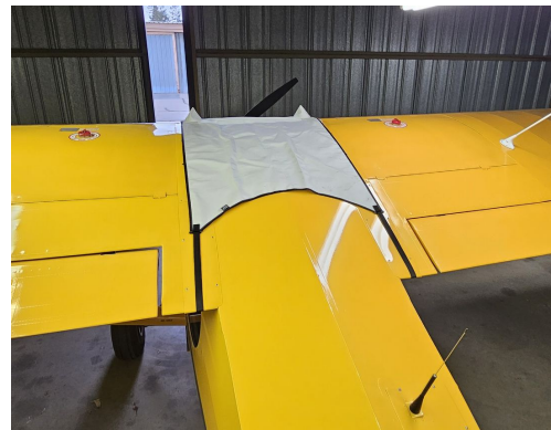
Piper PA-11 Over-Top Canopy Cover, extends to cover gas caps Piper PA-12: Super Cruiser, J5 Cub Windshield/Skylight Cover