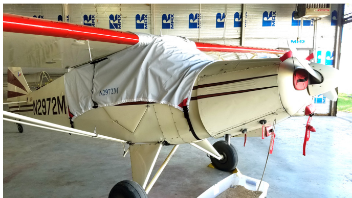
Piper PA-12 Wrap-Around Canopy Cover, Engine Plugs

Engine Inlet Plugs are custom fit for your Piper PA-12: Super Cruiser, J5 Cub intakes, made with heavy-duty vinyl material, and stuffed with a single block of sculpted urethane foam. Each plug has a zipper that allows the foam to be removed and dried if necessary. Engine plugs have warning flags that are visible from the cockpit or 'remove before flight' streamers sewn onto the face of the plugs. Most plugs are imprinted with the aircraft registration number in black for an extra charge. Storage bag NOT included. Engine plugs may be inserted after flight when the engine is still warm. Engine Inlet Plugs are commonly referred to as Cowl Plugs, Intake Plugs, Cowl Blocks, Engine Blocks, and Engine Bungs.