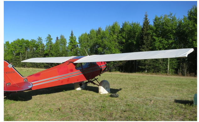
Piper PA-12 Wing Covers