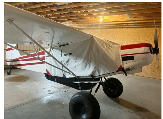
Piper PA-11 Extended Canopy Cover, Over the Top Style