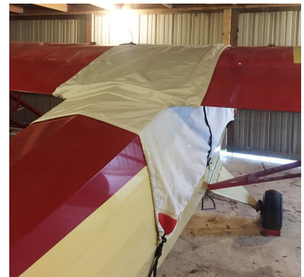
Piper PA-12 Over The Top Style Canopy Cover