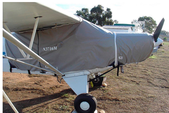
Piper PA-12 Super Cruiser Extended Over-the-Top Canopy Cover & Engine Cover