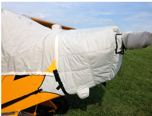
Piper J-3 Cub Insulated Engine Cover with added Pre-heater Access Flaps