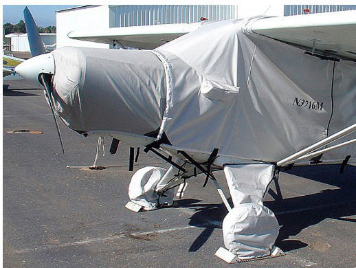
Piper PA-12 Landing Gear Covers

This cover type is made from Silver Acrylic Sunbrella canvas and is 100% lined with a soft and smooth microfiber. Bruce's Custom Covers developed this material combination especially for aircraft protection. The outer material is medium weight and treated for water resistance, UV resistance and anti-static buildup. The inner lining is a very soft and smooth microfiber to prevent scratching. The material is very reflective, and tests show that the cabin interior temperature can be reduced to near-ambient temperature on the hottest of days. It is water, ice and snow repellent, yet breathable to allow moisture to escape from between the cover and the aircraft surface.