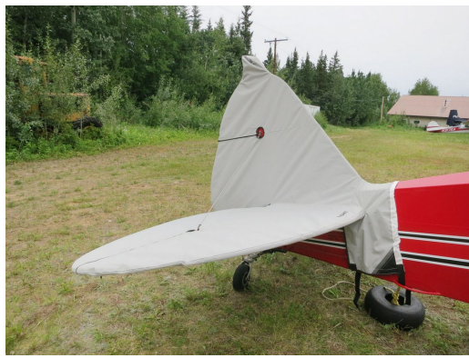
Piper PA-12 Abbreviated Empennage Cover