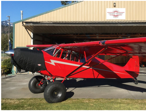
Piper PA-12 Insulated Engine Cover