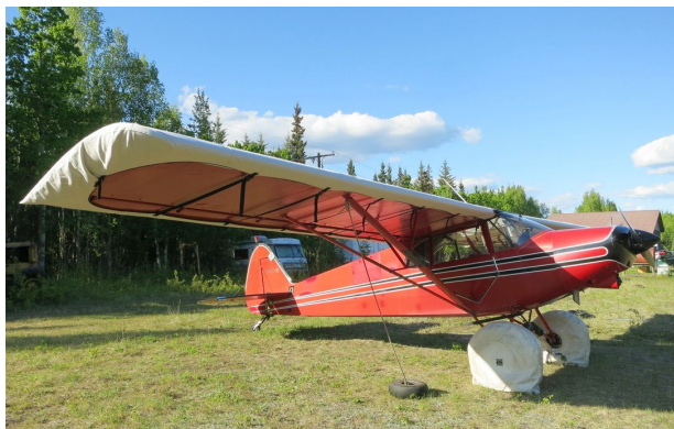
Piper PA-12 Wing Covers