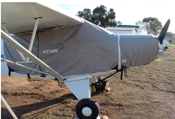
Piper PA-12 Super Cruiser Extended Over-the-Top Canopy Cover & Engine Cover

This cover type is made from Silver Acrylic Sunbrella canvas and is 100% lined with a soft and smooth microfiber. Bruce's Custom Covers developed this material combination especially for aircraft protection. The outer material is medium weight and treated for water resistance, UV resistance and anti-static buildup. The inner lining is a very soft and smooth microfiber to prevent scratching. The material is very reflective, and tests show that the cabin interior temperature can be reduced to near-ambient temperature on the hottest of days. It is water, ice and snow repellent, yet breathable to allow moisture to escape from between the cover and the aircraft surface.