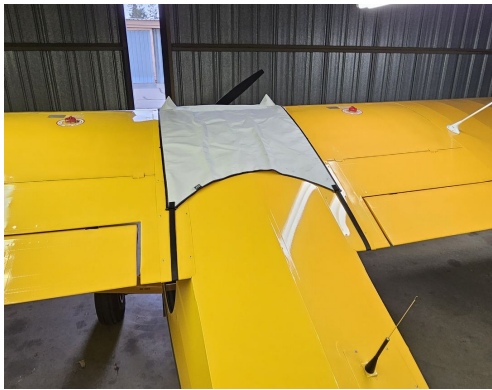
Piper PA-12: Super Cruiser, J5 Cub Windshield/Skylight Cover

The material is very reflective, and tests show that the cabin interior temperature can be reduced to near-ambient temperature on the hottest of days. It is water, ice and snow repellent, yet breathable to allow moisture to escape from between the cover and the aircraft surface.