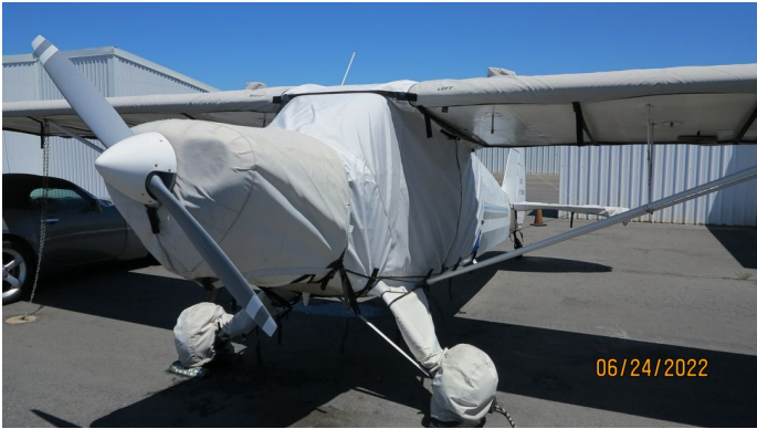
Piper PA-12 Over-Top Canopy Cover, Engine, Wing & Landing Gear Covers