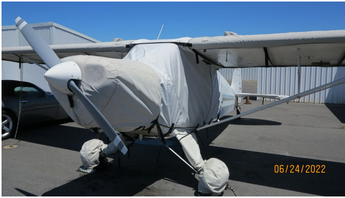
Piper PA-12 Over-Top Canopy Cover, Engine, Wing & Landing Gear Covers