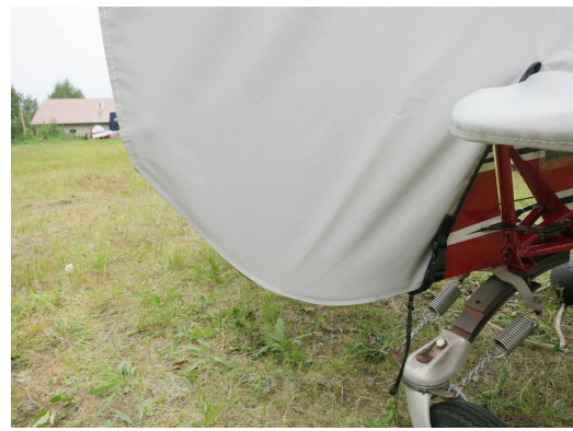
Piper PA-12 Abbreviated Empennage Cover