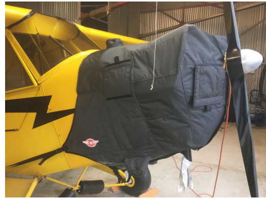
Piper J3 Cub Insulated Engine Cover